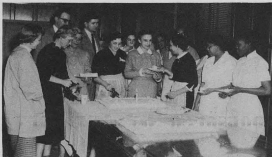
Employees help Gift Gallery celebrate; five cakes like those above were a feature attraction.

Gift Gallery's birthday celebration on February 12, provided more than 500 patients, employees, physicians, and visitors with the opportunity of enjoying cake and coffee while congratulating this highly successful Auxiliary project on its first year of operation.