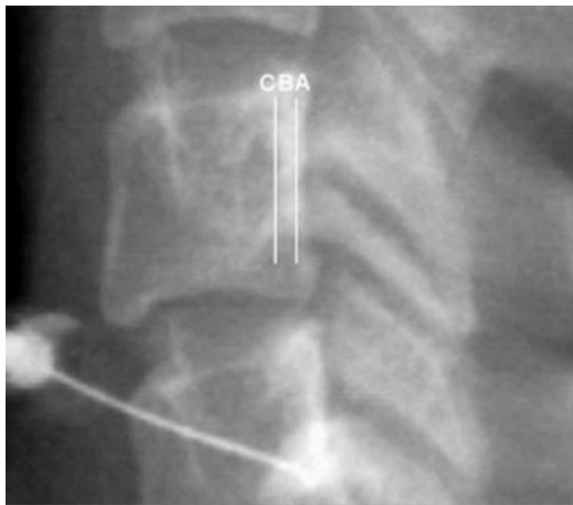
Fig. 2 Lateral cervical spine fluoroscopic spot image demonstrating various lateral zones. Zones A, B, and C are described in the text. (Reprinted with permission from Ma D, Gilula LA, Riew KR. Complications of fluoroscopically guided extraforaminal cervical nerve blocks. An analysis of 1036 injections. J Bone Joint Surg Am 2005;87:1025–1030.)