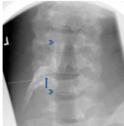
Fig. 3 Frontal radiograph of the cervical spine with needle tip in zone 3 (arrow) demonstrating epidural flow of the injectate (arrowheads).

Frontal and lateral fluoroscopic spot images were reviewed to assess for central epidural flow. There was uncertainty regarding the degree of central epidural flow utilizing frontal and lateral fluoroscopic spot images in six injections. No injections were classified as zone 1. In zone 2 ( n = 45 ), 13 injections demonstrated central epidural flow and 32 were without central epidural flow. Therefore, 28.9% of zone 2 injections had an epidural effect. In zone 3 ( n = 74 ), 62 injections demonstrated central epidural flow and 12 were without central epidural flow (► Fig. 3 ). Therefore, 83.8% of zone 3 injections had an epidural effect. In zone 4 ( n = 7 ; ► Fig. 4 ), all 7 injections demonstrated central epidural flow and therefore had an epidural effect. Therefore, there is a statistically significant difference in epidural flow of the