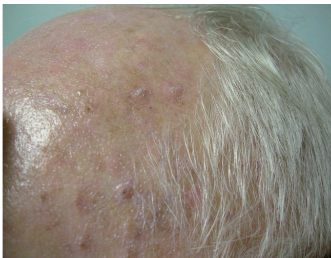
Figure 12 Development of squamous cell carcinoma during treatment with vemurafenib (BRAF-inhibitor)

developed a hand-foot skin reaction (25). In clinical trials treating colorectal cancer with regorafenib, Grothey et al. observed grade three or higher hand-foot skin reactions in 17% of patients (83 of 500) (26).