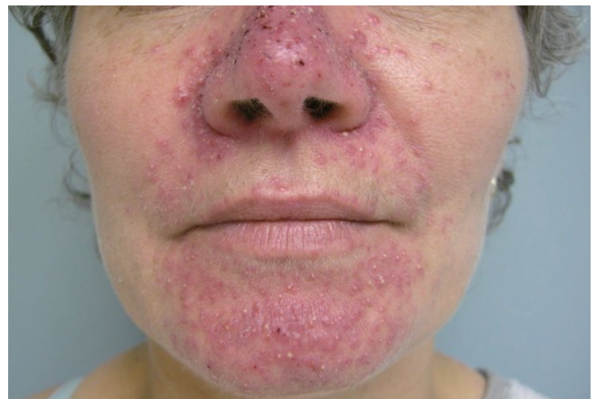
Figure 1 Acneiform rash affecting the face during EGFR inhibitor treatment

The most common cutaneous toxicity resulting from treatment with EGFR inhibitors is the development of an acneiform eruption. This consists of follicular sterile pustules and papules usually involving the face, scalp, and upper trunk ( Figures 1,2,3 ). Secondary infections are commonly observed, but must be confirmed by bacterial culture. Histopathology shows folliculitis with collections of neutrophils within the follicles and lymphocytes