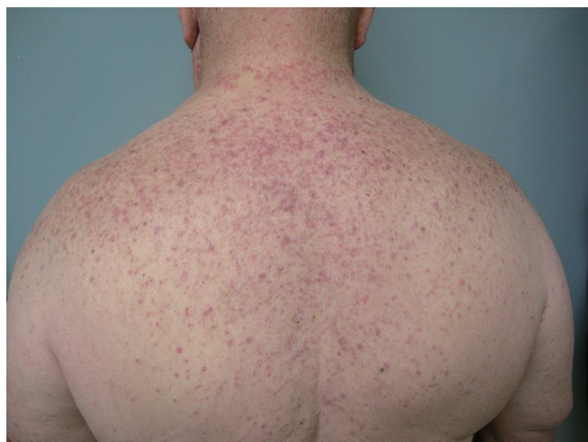
Figure 2 Acneiform rash affecting the back during EGFR inhibitor treatment