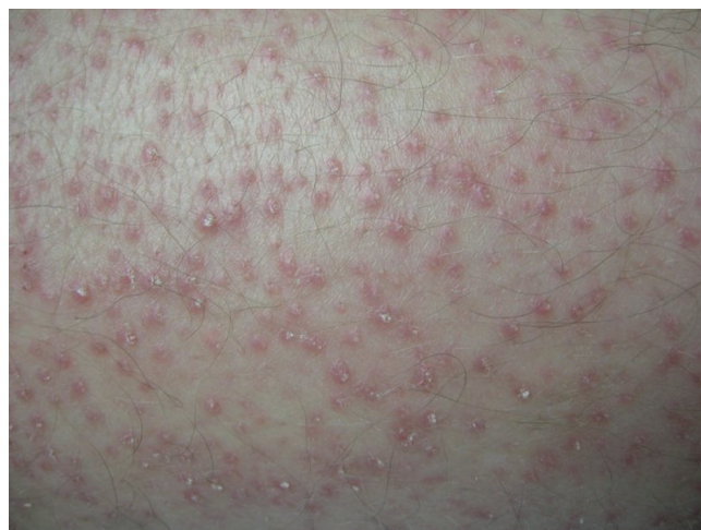
Figure 11 Follicular keratotic papules associated with multikinase-inhibitor treatment

Management of the HFSR can be challenging but the basic principles include minimizing friction and trauma with comfortable well fitting shoes and protective gloves. Topical corticosteroids can minimize inflammation and thickened hyperkeratotic plaques on the hands and feet can be softened with the use of keratolytic creams such as urea or lactic acid. Dose reduction of the regorafenib is another option for reducing the bothersome side effects. Unlike with the acneiform eruption seen with EGFR inhibitors,