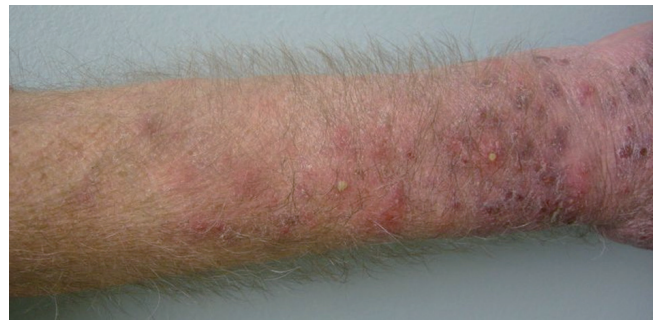
Figure 7 Cutaneous bacterial superinfection during EGFR inhibitor treatment

Cutaneous superinfections can complicate the cutaneous toxicities affecting patients treated with EGFR inhibitors (Figure 7). Several studies have been conducted to explore the microbiology of these infections. Amitay-Laish et al. studied 29 patients on EGFR inhibitors cetuximab or erlotinib and found that 24 patients had a papulopustular reaction (21). They divided this cohort into two groups based on when they developed the papulopustular eruption. The early phase group contained seventeen patients and had a median onset at 8 days. The late phase group had a median onset at 200 days and contained seven patients. Staphylococcus aureus was found in 7 of 13 early phase patients and in all 7 late phase patients. The high incidence of staphylococcal infection demonstrates the importance of bacterial cultures in the assessment and treatment of EGFR inhibitor eruptions. This study also emphasizes the importance of seeking a pathogenic microbial cause when patients who were stable on the EGFR inhibitors develop a late onset papulopustular reaction. Eilers et al. studied 221 patients treated with EGFR inhibitors and found that 84 showed evidence of infection at the sites of the cutaneous toxicity (22). Cultures revealed that fifty were