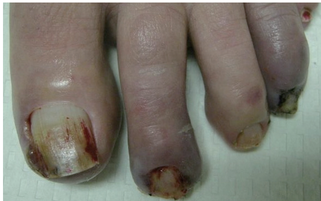
Figure 5 Paronychia with periungual pyogenic granuloma-like lesions associated with EGFR inhibitor treatment

Patients on EGFR inhibitors may develop nailfold changes after two or more months of treatment. These most commonly include nailfold inflammation (paronychia) and periungual pyogenic granuloma-like lesions ( Figure 5 ). As a secondary processes resulting from nail matrix inflammation, the nails can become dystrophic or the nail plates may lift from the nail beds (onycholysis). Trauma