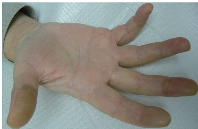
Figure 8 Hyperkeratotic plaques on areas of friction from regorafenib