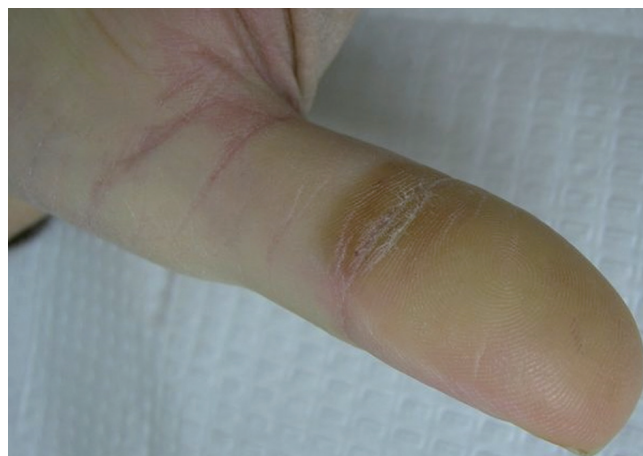
Figure 9 Hyperkeratotic plaque on thumb from regorafenib

start oral isotretinoin. If the practitioner is uncomfortable prescribing or managing treatment with oral isotretinoin, referral to a dermatologist with knowledge of EGFR inhibitor induced cutaneous toxicities may be beneficial for the initiation of treatment.