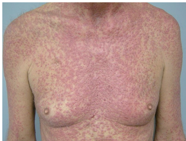
Figure 3 Acneiform rash affecting the chest during EGFR inhibitor treatment