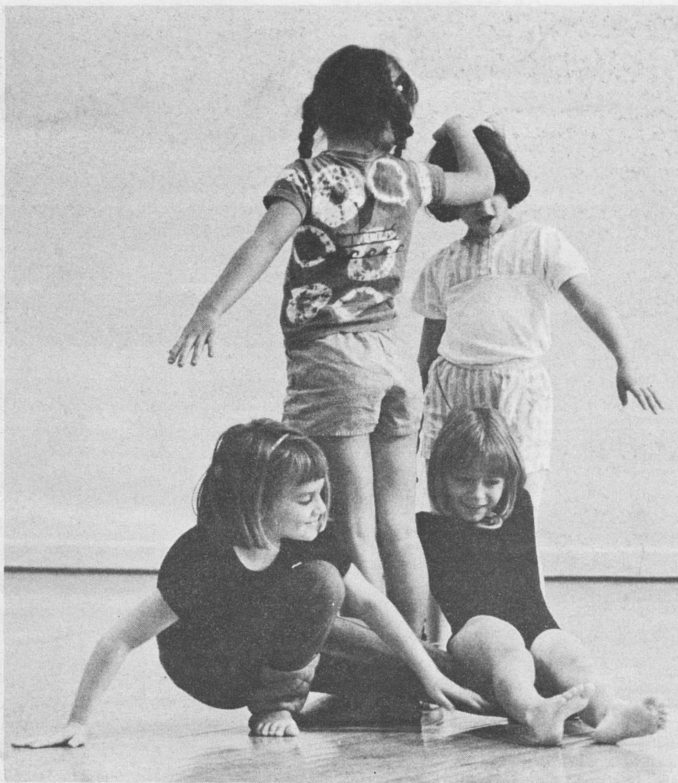
Children in the creative dance program develop strength, flexibility, coordination, rhythm and self-awareness.

Medical Campus employees: Send to: Personnel Office, Washington University, Box 8091, 4550 McKinley Ave., St. Louis, Mo. 63110.