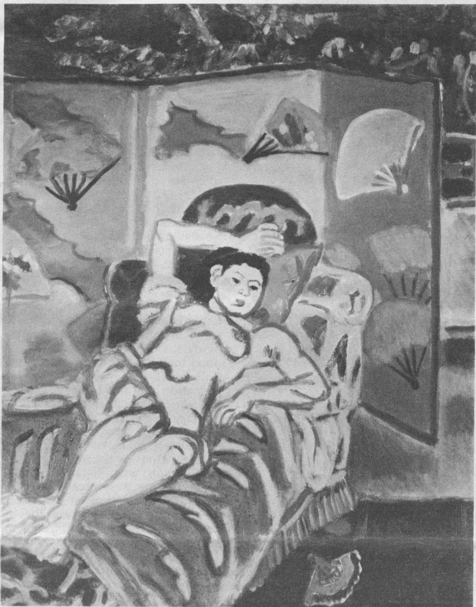
Umehara Ryuzaburo's "Nude With Fans" (1938) is one of 77 oil paintings by 26 Japanese artists to be displayed in the exhibit "Paris in Japan: The Japanese Encounter With European Painting."