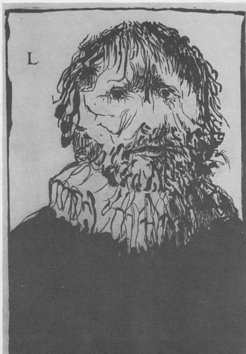
A dual exhibit of works by contemporary artist and illustrator Leonard Baskin opens at the WU Gallery of Art, Steinberg Hall, Sun., Feb. 19, and in Olin Library's Rare Book Department, Mon., Feb. 20. Above is a woodcut made by Baskin in 1964 of Dutch painter Jan Lievens (1607-1674). For further information, see Calendar listings, page 4.