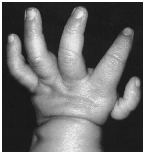
Fig. 1-F Type 4. Type-4 thumbs are attached by soft tissue only.

thumb deficiency could not be classified with use of the modified Blauth and Schneider-Sickert criteria, although all of them had an absent radius and a functioning but abnormal thumb. One hundred and nineteen patients with 191 af-