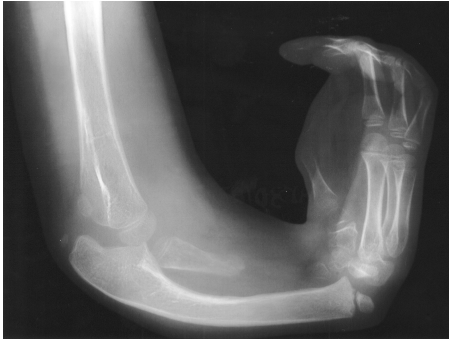
Fig. 2-C Type 3, with a pollicized index finger.