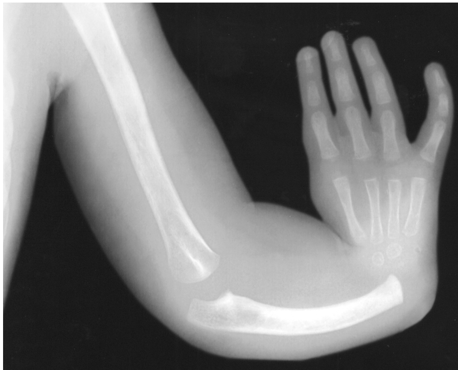
Fig. 2-D Type 4, with a type-5 thumb deficiency.

zone of polarizing activity 45 , and, in mice, disruption of the Shh pathway has been associated with a spectrum of developmental anomalies very similar to VACTERL 46 .