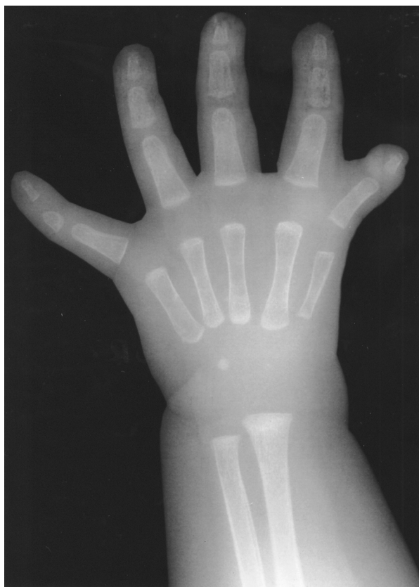
Fig. 1-E Type 3B. The base of the first metacarpal is absent, which is the key feature of type 3B. Otherwise, type-3B thumbs have the same characteristics as type-3A thumbs.

study if inadequate information was available for classification of either the thumb or the radius or if they had an ipsilateral triphalangeal thumb, delta phalanx in the thumb, duplicated thumb, ulnar hypoplasia, aphalangia of fingers, or symbrachydactyly. Six patients (twelve affected extremities) with TAR syndrome were also excluded because the