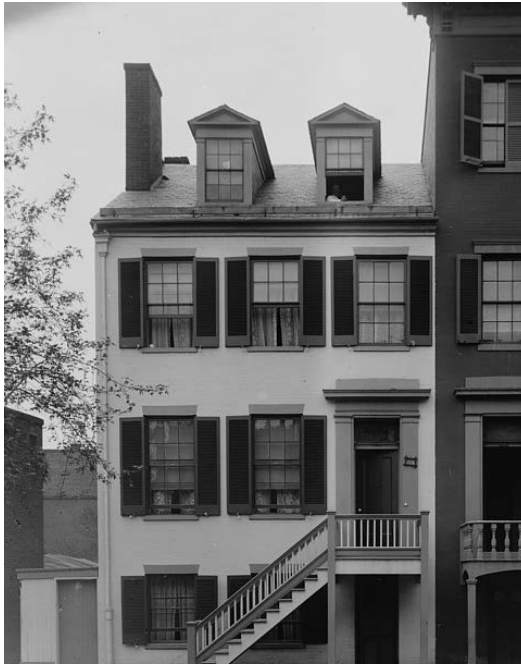
The building on H Street, between 6th and 7th Streets NW, that once was the Surratt boardinghouse where Booth and his confederates plotted (Source: Library of Congress, Prints & Photographs Division, LC-DIG-cwpbh-03432).

The tribunal that stood in judgment of these eight individuals bore little resemblance to the D.C. Supreme Court two miles to the north. It was a makeshift court, convened in an ersatz courtroom, measuring approximately forty feet by twenty-seven feet, on the third floor of the Arsenal. 29 Most importantly, the entity that would resolve the fate of the accused was entirely the creation of, and was administered by, the War Department. There was no judge. A panel of nine military officers, most of whom had no legal training, served as “members” of the commission. 30 They were detailed to the court by another military officer,