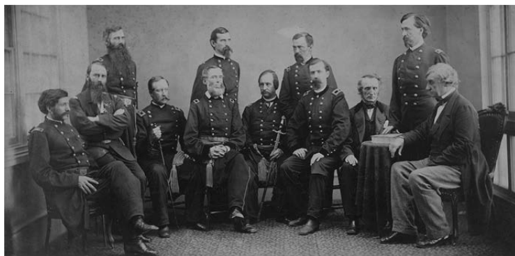
The military commission and prosecutors for the Lincoln assassination trial. Left to right: Lt. Col. David R. Clendenin, Col. C.H. Tompkins, Brig. Gen. Thomas M. Harris, Brig. Gen. Albion P. Howe, Brig. Gen. James Ekin, Maj. Gen. Lew Wallace, Maj. Gen. David Hunter (President of the Commission), Maj. Gen. August V. Kautz, Brig. Gen. Robert S. Foster, Rep. John A. Bingham, Brig. Gen. Henry L. Burnett, and Judge Advocate General Joseph Holt.

On June 30, after more than seven weeks of trial and testimony of more than 300 witnesses, the commission found all eight defendants guilty of at least some involvement in the events of April 14. 37 The commission recommended that three of the defendants—Arnold, O’Laughlen, and Mudd—be sentenced to life imprisonment at hard labor; that Spangler serve a term of six years at hard labor; and that the other four be executed. 38