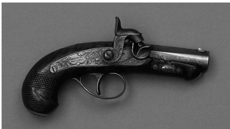
The derringer that John Wilkes Booth used to kill Abraham Lincoln.

What made the murder even more shocking was that the blow arrived not from what remained of the Confederate Army, in a theater of war, but instead under the most banal of circumstances, in a theater of a much more ordinary kind, and at the hand of a common actor, not yet twenty-seven years of age. While no one was paying him any mind, John Wilkes Booth crept from behind the President, brandishing a tiny pistol to terrifying effect—the fatal shot timed to coincide with the audience’s predictable reaction to the play’s surest laugh-line. 6