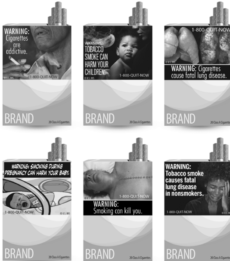
ILLUSTRATION A: U.S. FOOD AND DRUG ADMINISTRATION CIGARETTE HEALTH WARNINGS 197