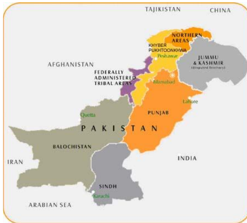
Fig 1. Map of Pakistan