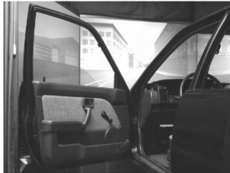
Figure 2: Argus driving simulator

participants started the driving in the simulator in a special practice-program, to get used to the car. The participant decided when no more practice was needed (usually after 15–30 min). The test program consisted of 70 traffic situations, each presenting a different challenge. The drive took about 40–60 min, depending on the speed and the number of mistakes made. The simulator required the driver to deal with the type of situations that one would frequently encounter when driving a car and also challenges that were less common.