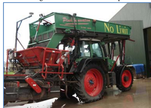
Planting machine in Holland