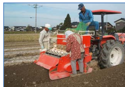
Planting bulbs with machine in Japan