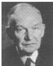
Fredrick Soddy's photo (donated by Herman E. Daly in 1984)

In this study, we would like to verify Soddy's assertion of the social reform via monetary reform on the historical background, to introduce how his concepts of economy is depended on the law of physics and to reevaluate a present intent of his theory about “Wealth and Debt” by comparing with contemporary economists such as J.M. Keynes. [5]