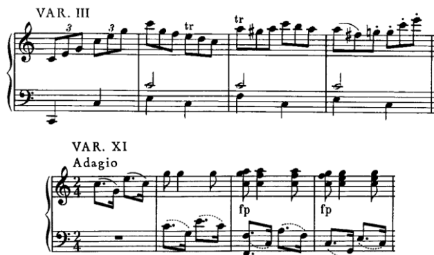
Figure 2. The beginning of two variations of the theme shown in Figure 1.

internal structure of those phrases can also show common features: the harmony is often similar; there can be common notes, especially in important positions like beginnings and endings, and the variation sometimes clearly gives a decorated version of the melody and/or bass of the original. Figure 2 shows the first four bars of two variations of the theme shown in Figure 1.