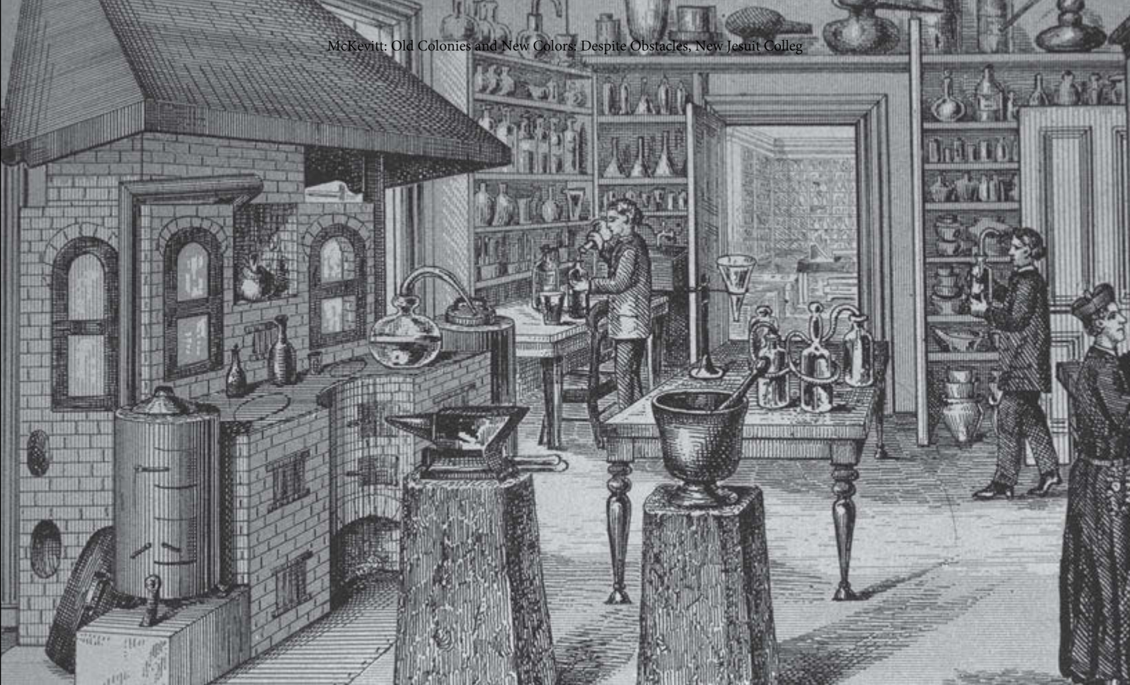
Although all Jesuit colleges in the U.S. offered a classical curriculum, institutions in the West and Midwest also provided vocational training. This woodcut is of a class in assaying at Santa Clara College c. 1877.

although with more success in the East. “For the mere bookworm – for the Latin and Greek antiquarian – this is certainly not the country,” a California educator wrote. Nevertheless, higher superiors enjoined compliance with hallowed custom, but resistance to liberal education kept native-born Jesuits in a constant boil over how best to respond to the peculiarities of American learning.