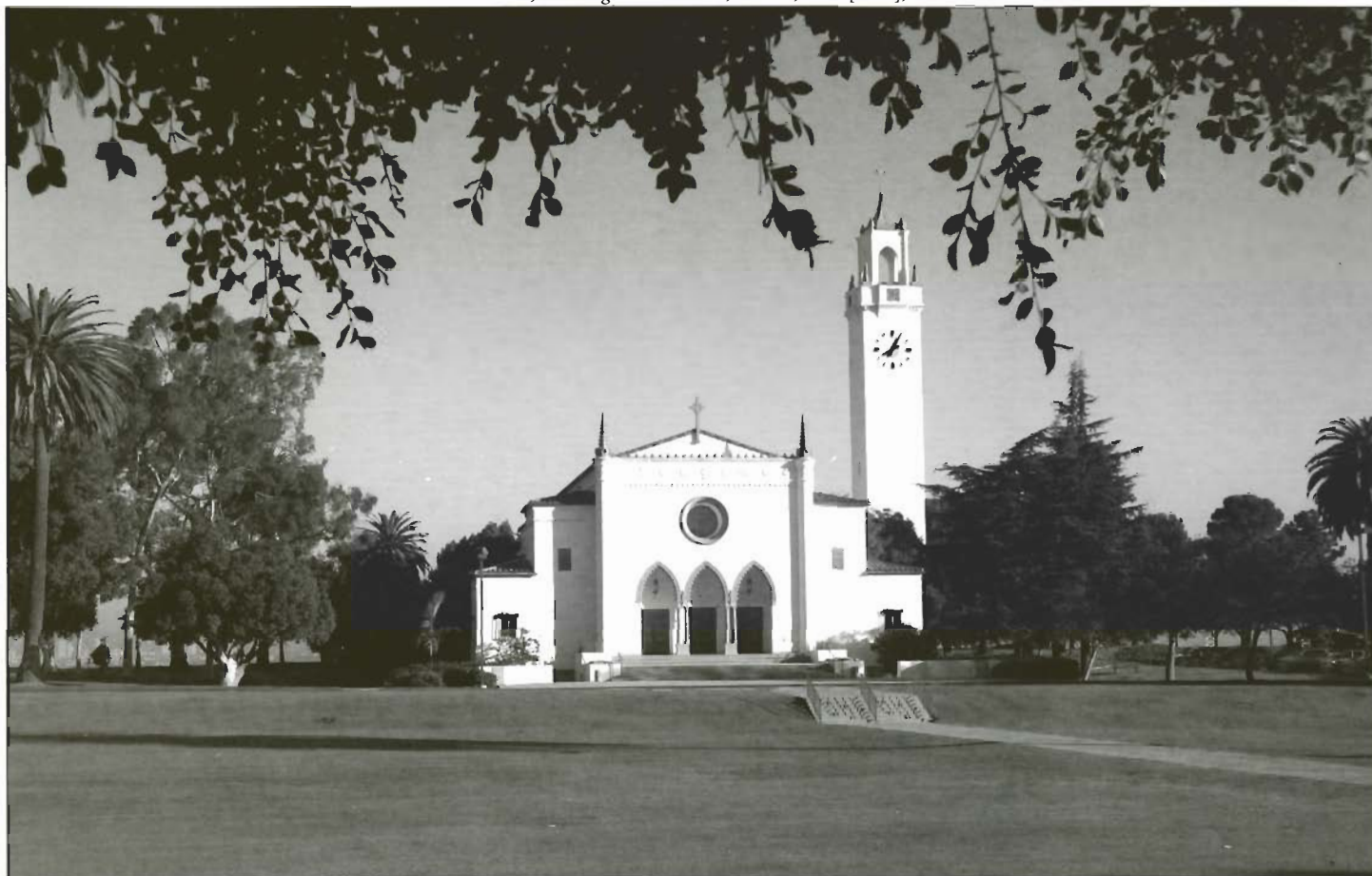
Loyola Marymount University.

has been established between number of theology credits and future salary range. Thus, there is frequent resistance to universal requirements in theology among both students and some colleagues in other disciplines. All too familiar is the question, "But what can I do with theology?"