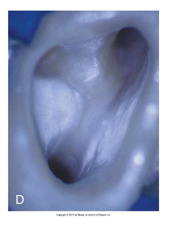
Figure 3 – Removing of the mesial ceiling of dentin. (Cohen's Pathways of the Pulp 10<sup>th</sup> edition, Fig. 7-102D) The same tooth from Figure 2, after removing of the mesial ceiling of dentin and troughing the mesial developmental groove, no MB2 canal is found. As seen using x13.6 magnification.

Stropko noted that it is sometimes necessary to first clean and shape the MB1 before fully investigating the presence of a hard-to-find MB2 (1999). This can aid in identifying the anatomical line that emanates from the prepared MB1 and extends towards the MB2. Stropko also addressed the coronal anatomy of MB2. He notes that the canal moves from the distal to the mesial from the orifice apically in the coronal 1 to 3 mm. This causes the tip of the initial instrument to catch at the mesial wall, thus limiting its apical progression. He advised that this overlying roof of dentin should be eliminated to achieve straighter access to the apical extent of the canal. Gilles & Reader echoed the recommendation, and advised directing the endodontic explorer from the distal toward the mesial to account for this mesial dentinal extension, in efforts to locate the MB2 orifice (1990).