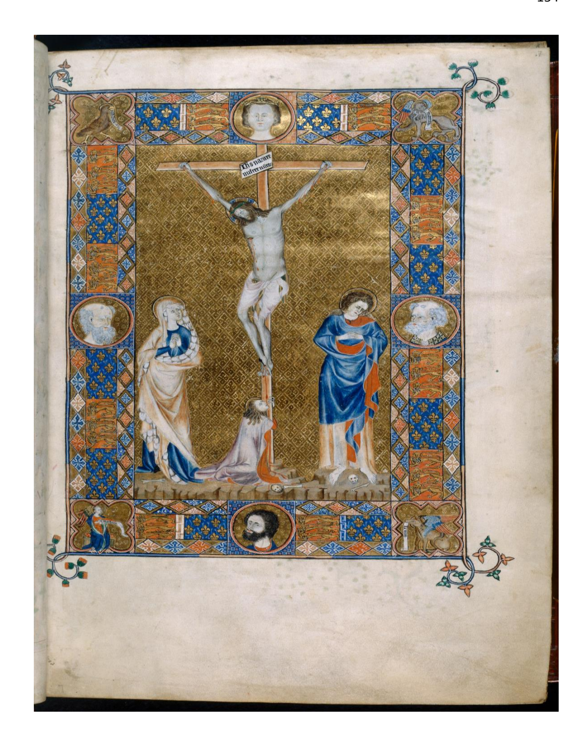
Figure 2: Miniature of the Crucifixion. London, British Library Board, Add MS 49622 f. 7r.