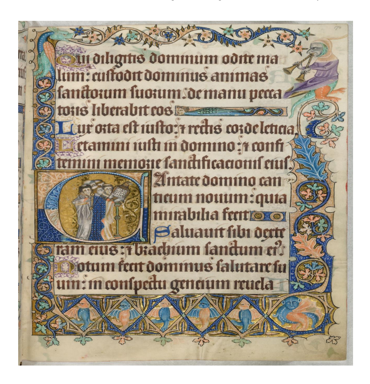
Figure 3: Monks in Prayer. London, British Library Board, Add MS 42130. Fol. 174r.

30ure soule."<sup>296</sup> The illustrated cover depicts an image of twelve nuns listening as another nun reads to them.<sup>297</sup> Here we have again a moment where the text and the image illustrate a method of communal learning and reading familiar to the nuns at Syon.