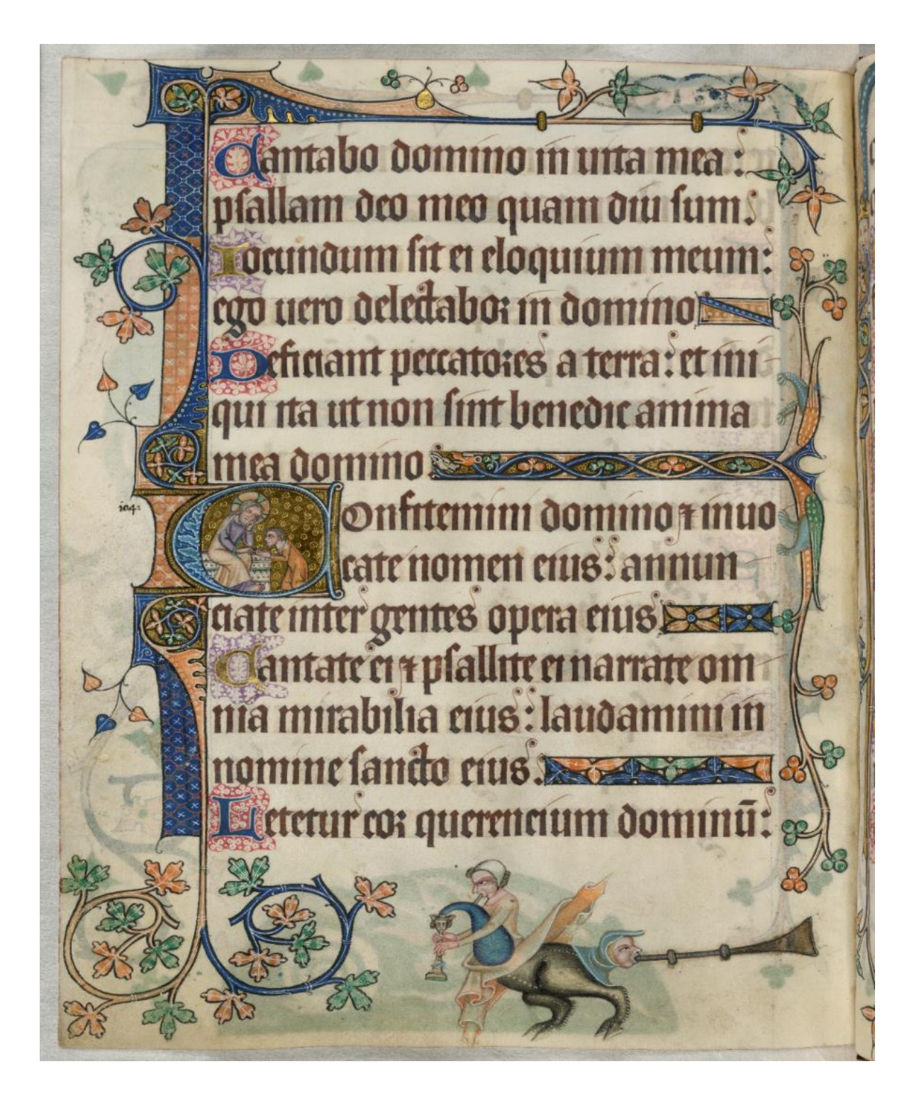
Figure 5. The Lord, Seated Hearing Confession in the Luttrell Psalter. London, British Library Board, MS ADD 42130 Fol 185v.