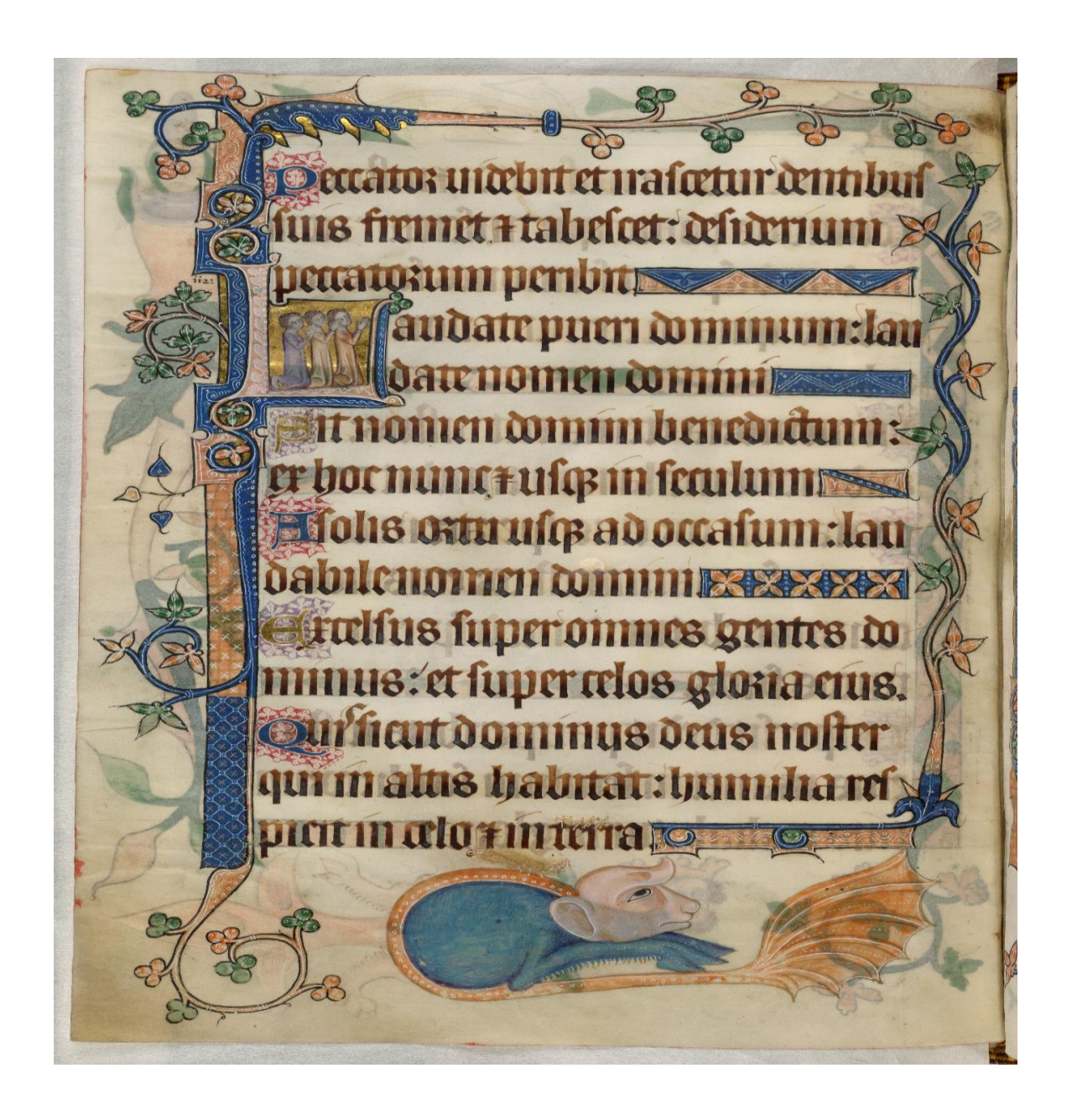
Figure 4: Ladies in Prayer appear in The Lutrrell Psalter. London, British Library Board, Add MS 42130. Fol. 174r.