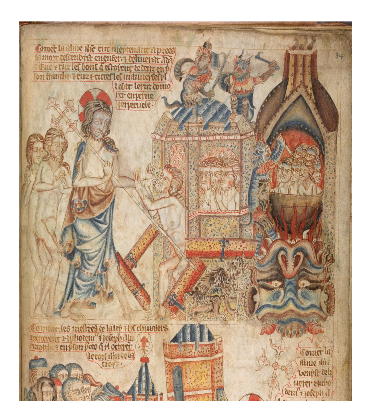
Figure 8. The Harrowing of Hell in the Holkham Bible. London, British Library Board, Add 47682 MS. Fol. 34r .Fol 34r. In the first half of book, before Christ ascends to heaven, the end times are predicted.