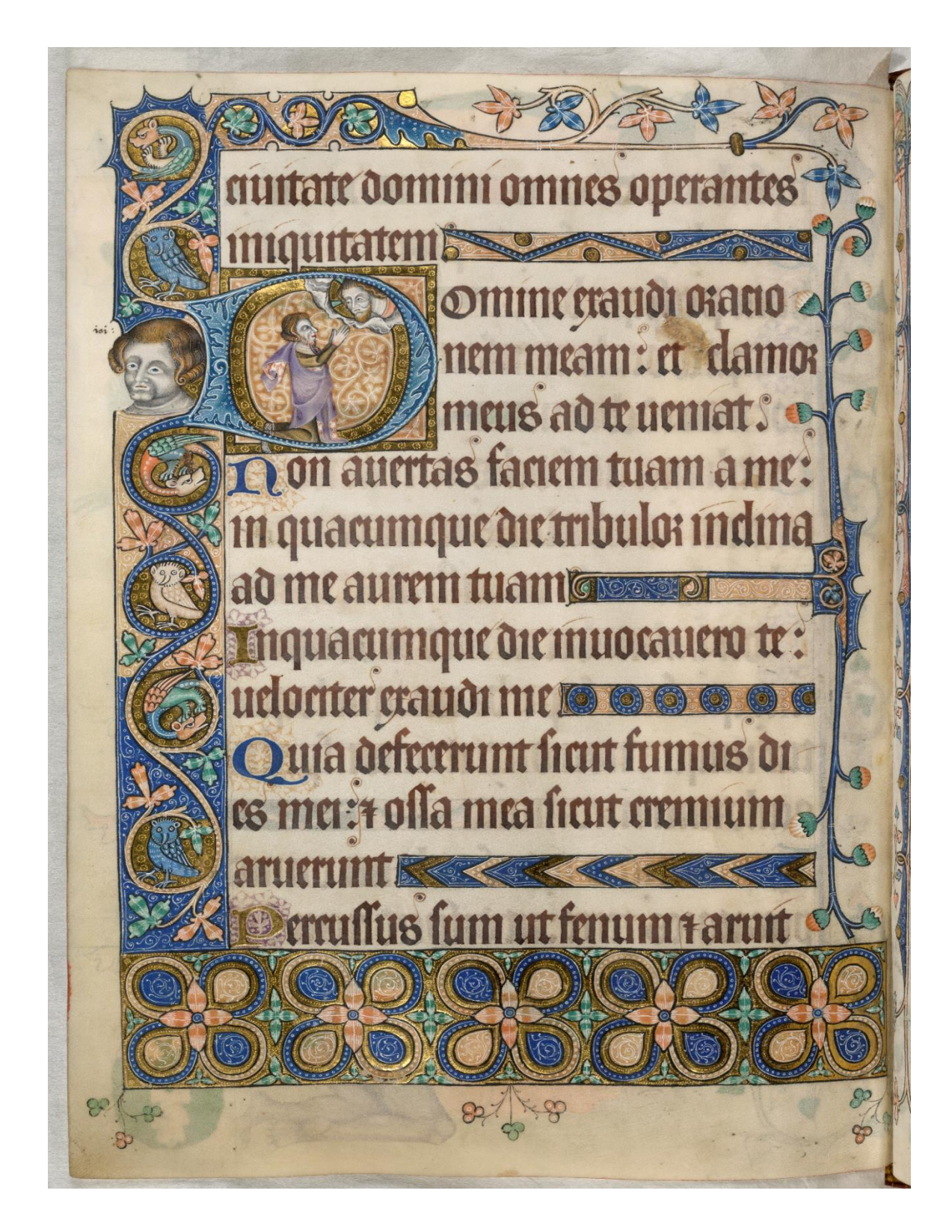
Figure 6. Man Kneeling Before the Lord. London, British Library Board, MS ADD 42130/F177v.