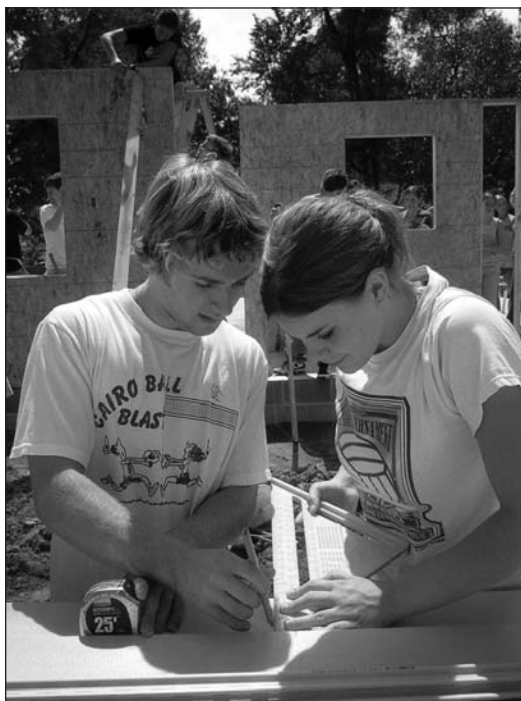
Creighton University students participate in Habitat for Humanity build.