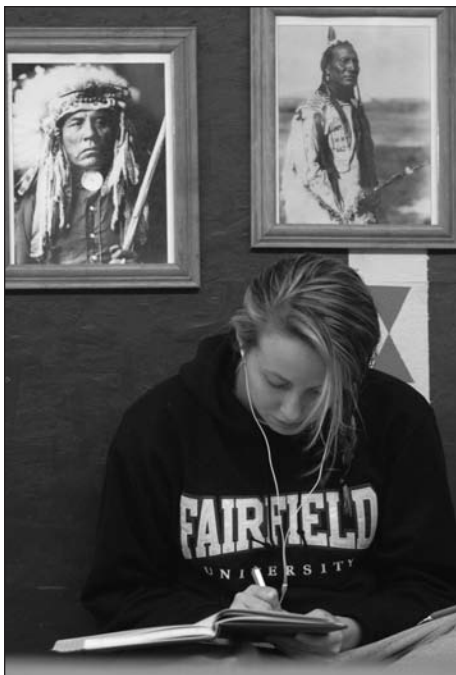
A Fairfield University student completes a log of her service trip to the Pine Ridge reservation in South Dakota.