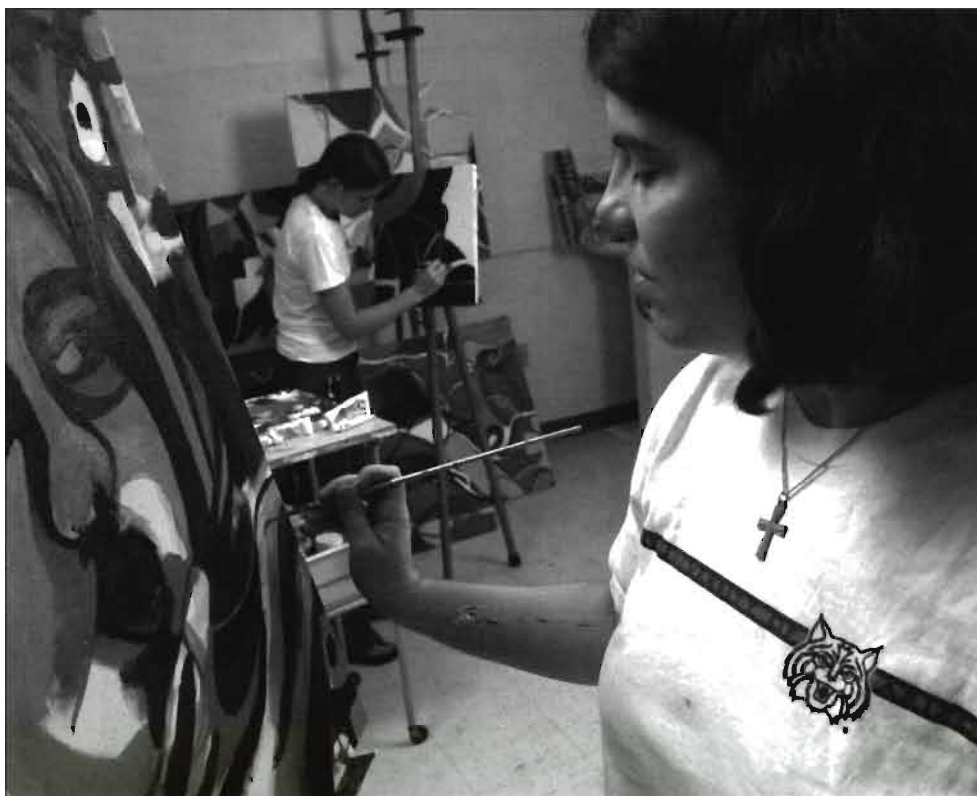
Students of art concentrating on their pieces at Xavier University.

I worried that the students and parents to whom I spoke may have felt this to be too heavy a message on a day meant for celebrations and congratulations. But it is part of the genius of Ignatius that our celebrations can never set aside the broader context of the ongoing work to which our institutions are committed: the work of using our knowledge to fashion a world of peace and justice for every person alive today and in centuries to come. For in the end, I said, the work of Fordham, the work of Ignatius, the work of building up a world of compassion and humanity, is the work of Love. ■