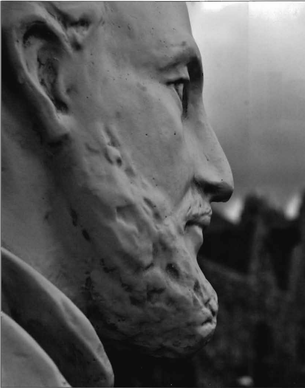
Statue of St. Ignatius, St. Joseph's University.

not disruptive of the culture, not an alien patch superimposed upon it, but a line of development within the culture. (Bernard Lonergan, Method in Theology , 362)