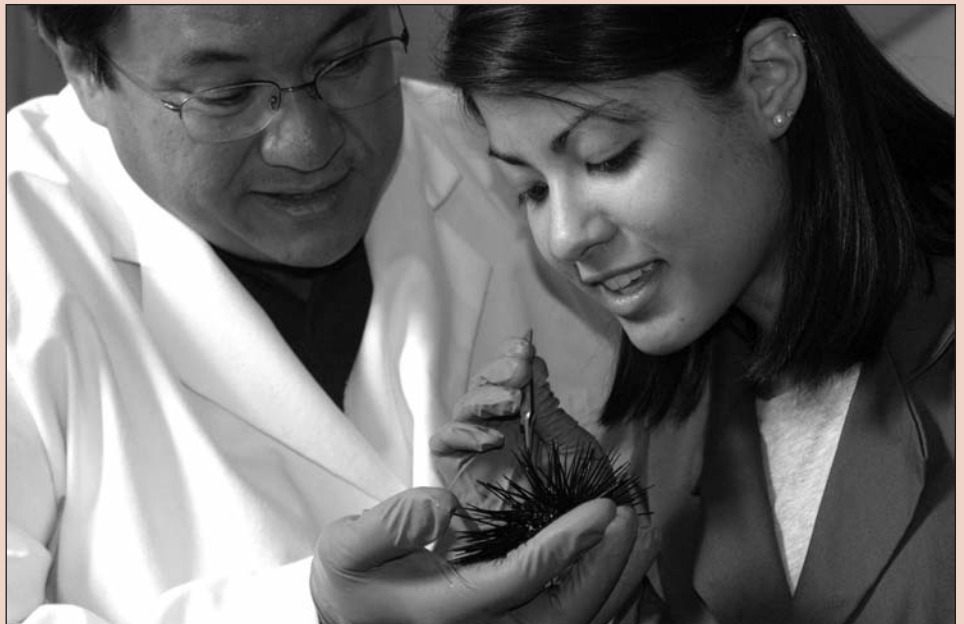
University of Scranton's faculty/student research program.

and students at all levels participate in ethical business practices first hand through NetImpact, a network of MBAs, graduate students and young professionals committed to earning profits while creating social change, and KIVA, a not-for-profit microlending organization which makes small loans to global entrepreneurs.