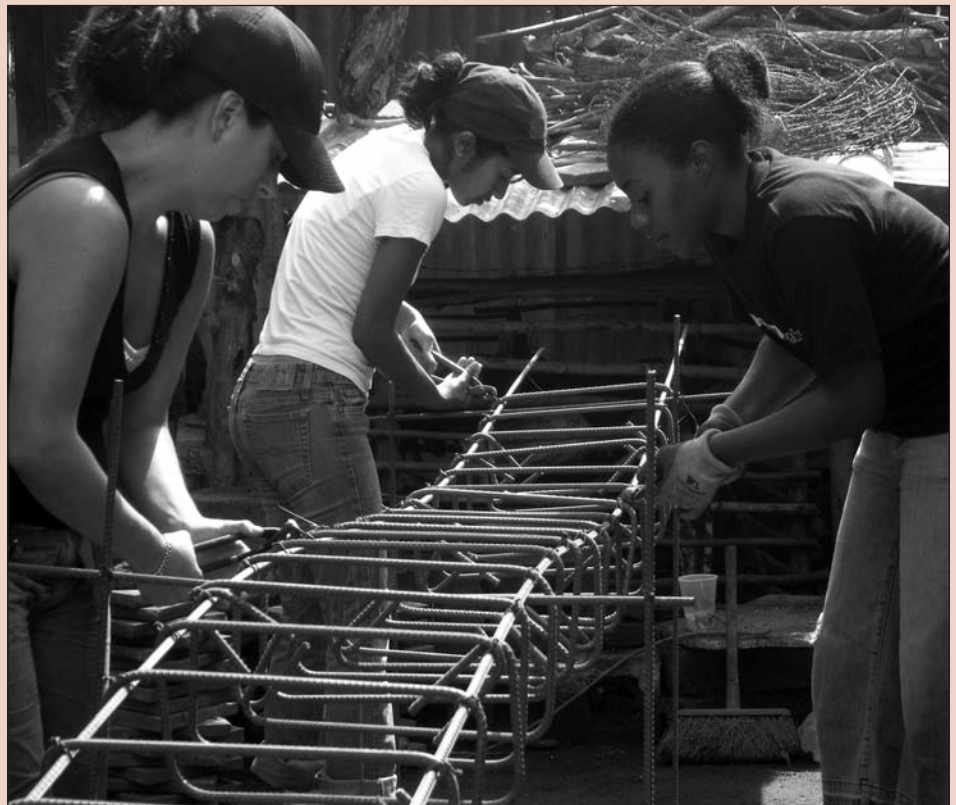
Students participating in the University of San Francisco's Architecture and Community Design program.

In the courses on community design outreach, international projects, and construction innovation lab, student teams work on projects ranging from local parks, urban food gardens, and historic preservation adaptive reuse, to internationally located community centers, libraries, housing, vocational training centers, health clinics, and small-scale factories. Local