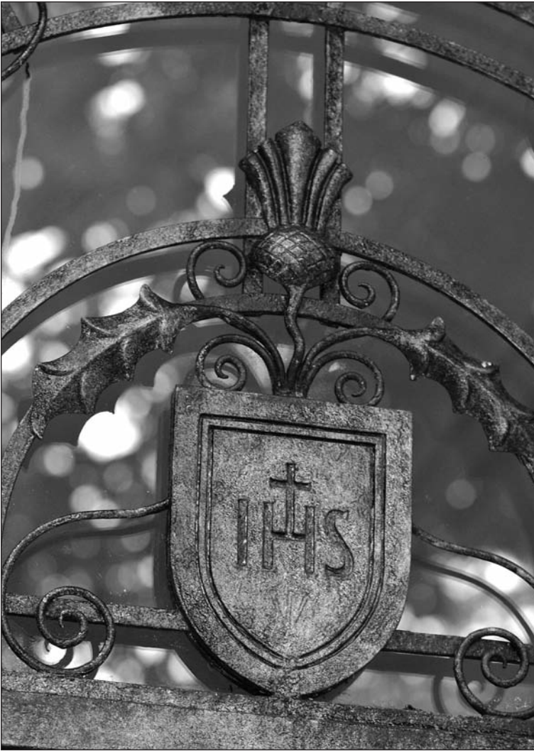
An ornate doorway, Fordham University.

Pope Benedict's call to faithfully help the Church. One way to do so would be to consistently voice the Catholic Church's teachings about homosexuality: Our Church teaches that one's sexuality is intrinsic to the person. It is a matter of nature, not a question of choice. All are made in the image of God; therefore, one can be both fully gay and fully Catholic.