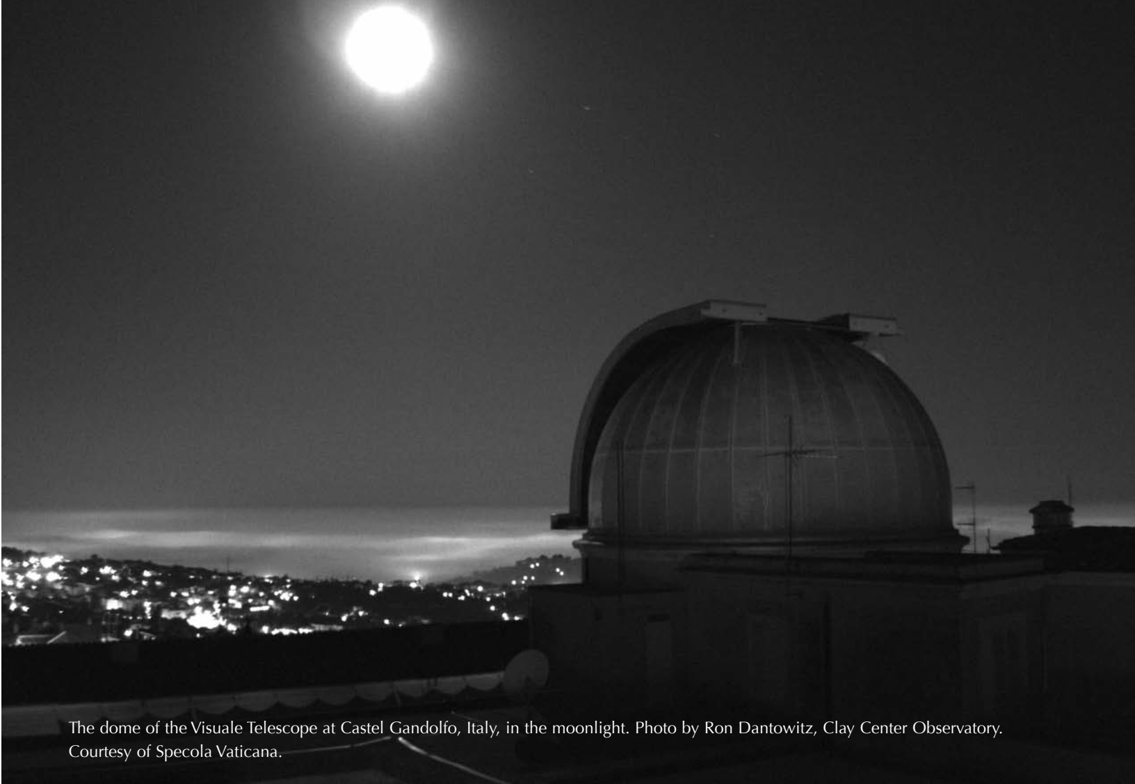
The dome of the Visuale Telescope at Castel Gandolfo, Italy, in the moonlight.

Furthermore, there is a third element here that is very important. It is the fertility of the universe. What this means is that the universe is so prolific in offering the opportunity for the success of both chance and necessary processes that such a character of the universe must be included in the discussion. The universe is 13.7 billion years old and it contains about 100 billion galaxies each of which contains 100 billion stars of an immense variety. All of these stars are building up the chemistry for life through the interaction of chance and necessary processes. A good example of a chance event would be two very simple molecules wandering about in the universe. They happen to meet one another and, when they do, they must make a more complex molecule because that is the nature of these molecules. But the temperature and pressure conditions are such that the chemical bonding to make a more complex molecule cannot happen at this time and place. So they wander off, but they or identical molecules meet trillions of times in this universe, and finally they meet and the temperature and pressure conditions are correct. As this process goes on and more complex molecules develop through the interaction of chance and necessity in a fertile universe.