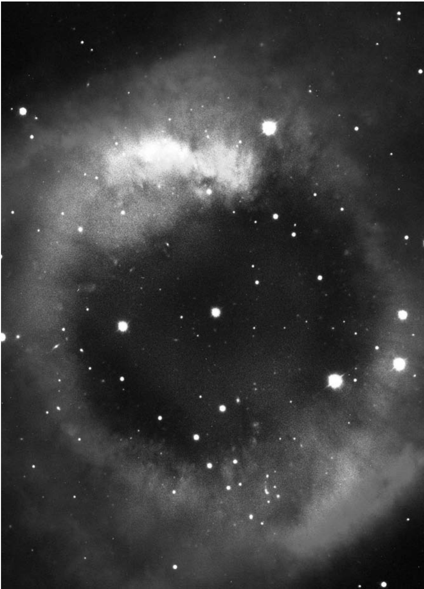
The Helix Nebula, NGC 7239, in Aquarius, which is 700 light years from us. Imaged at the Vatican Advanced Technology Telescope on Mt. Graham, Arizona.

In fact, reflections of a religious believer upon our scientific knowledge of a universe in evolution reveal a God who made a universe which shares in his own creativity. Such a view of creation can be found in early Christian writings, especially in those of St. Augustine in his comments on Genesis. Perhaps God should be seen more as a parent or as one who speaks encouraging and sustaining words. Scripture is very rich in these thoughts. It presents, indeed anthropomorphically, a God who gets angry, who disciplines, a God who nurtures the universe. God is working with the universe. The universe has a certain vitality of its own like a child does. It has the ability to respond to words of endearment and encouragement. Words which give life are richer than mere commands or information. In this way does God deal with the universe.