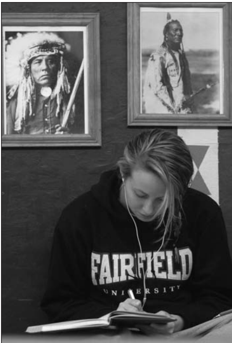
A Fairfield University student completes a log of her service trip to the Pine Ridge reservation in South Dakota.