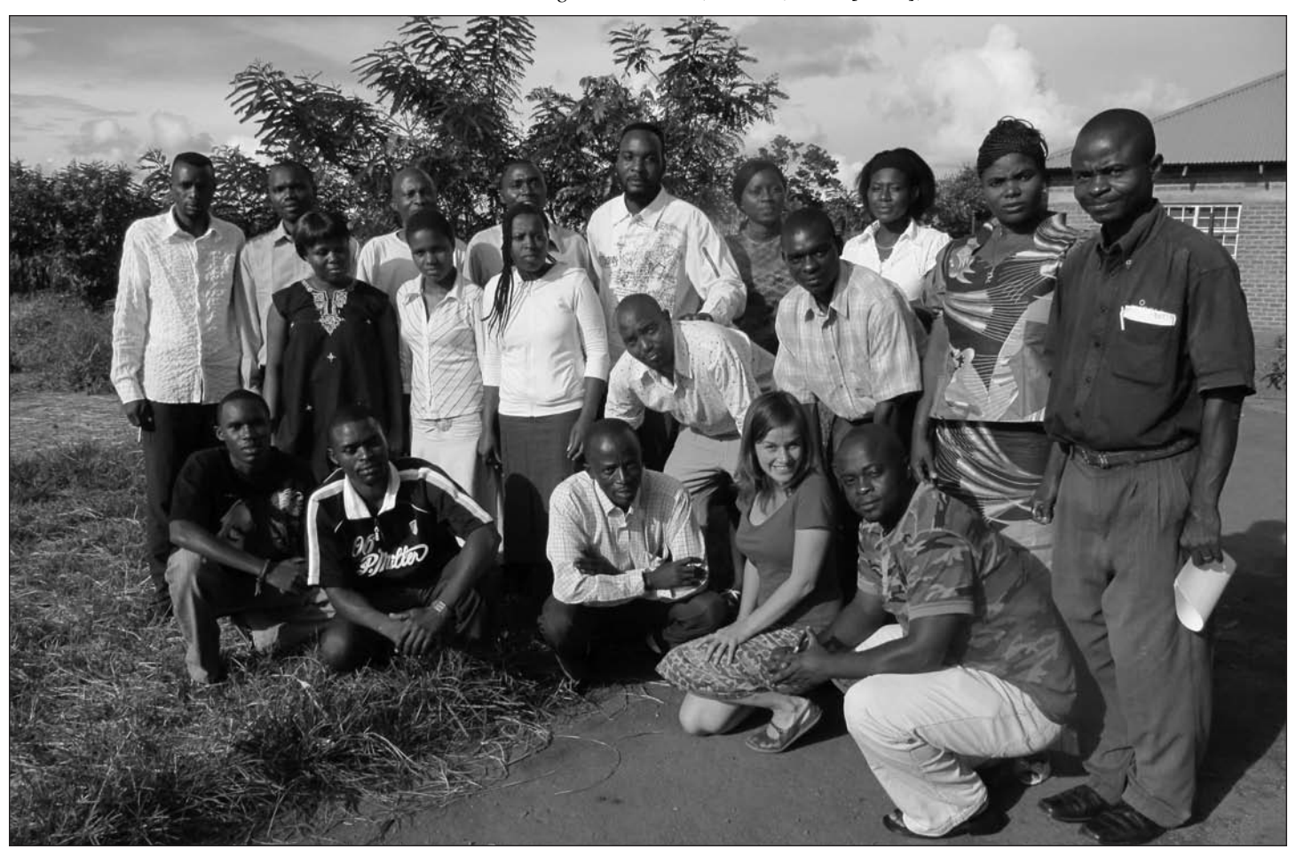
Seattle University students at the Dzaleka refugee camp in Malawi.

two ambitious projects that call for high levels of expertise and problem-solving skills. So far, that wager has paid off. Talented colleagues have been stepping forward. And, being an infrastructure-poor start-up has other advantages: no bureaucracy. The Commons has been able to experiment, make decisions, and move forward nimbly. Within six months of the day, pilot funding was secured, for example, computer labs were erected in two refugee camps, solar panels purchased and installed, electricity and bandwidth secured, the first couple of courses plotted, and enrollment protocols developed, some 300 student applications reviewed, and, most gratifyingly, course work was begun.