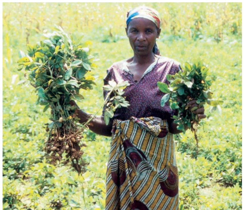
Rosette-resistant plants (left) improve groundnut yields

A large-scale household survey was conducted in three districts in the Teso farming system of north-eastern Uganda, and a database was compiled of social and economic data related to groundnut production, including groundnut rosette disease. The survey found that farmers consider several traits when selecting a groundnut variety, including drought resistance, duration, quality characteristics, yield, and pest and disease resistance. Rosette