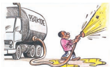
Don't use more spray than you need