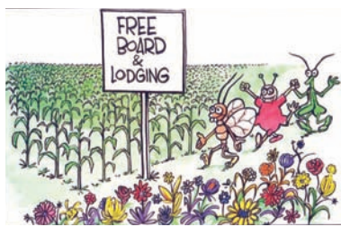
Flowering plants provide food for farmers' friends and attract them