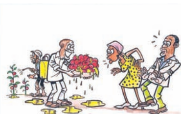
Produce may be dangerous if harvested before the pre-harvest interval