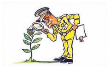
Scouting is detective work – inspect the crop very carefully before deciding whether to spray

Several supplementary dissemination resource materials were produced, including two posters translated into Kiswahili