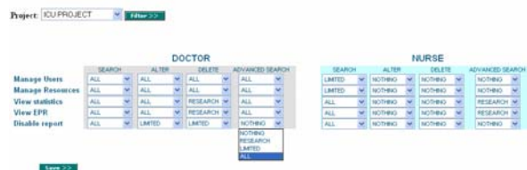
Figure 2 . Management tool for the model

In order to associate resources and actions to roles and projects, a management tool was developed. This tool allows the administrator of a certain project to associate the roles and access permissions (including exceptions) for each user that he is responsible for. It is sufficiently generic and modular since it can be used for any application that needs to assign access rights to its users.