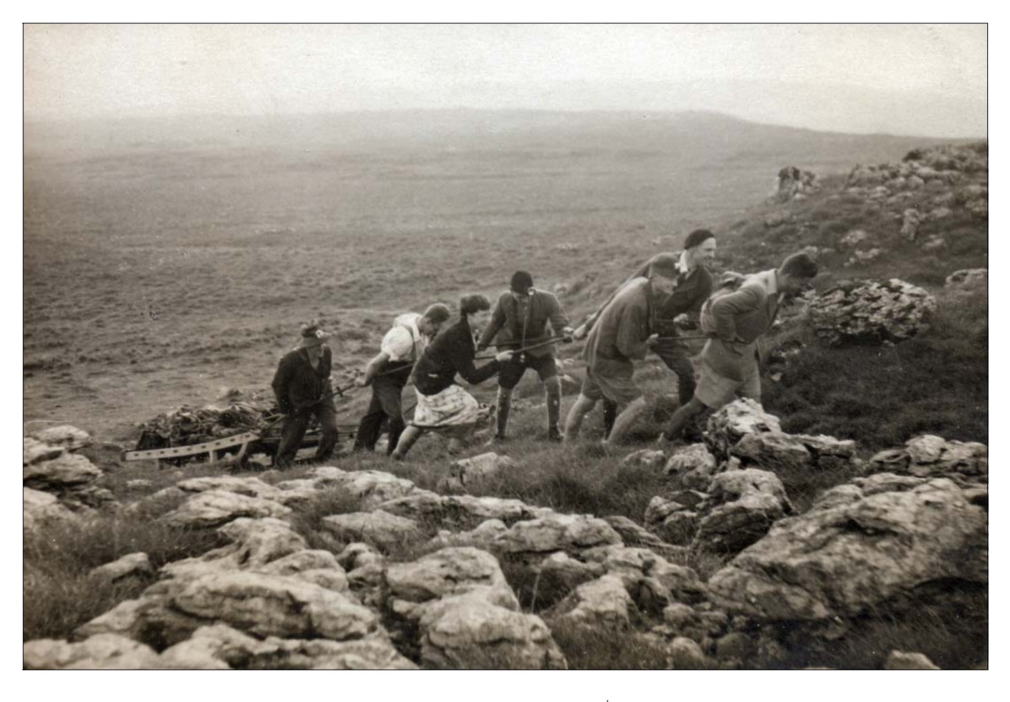
A novel way of transporting rope and ladder on the way to Sulber and Nick pots, September 3<sup>rd</sup> 1933 [Image No.P640564 from the second album of the H W Haywood Collection].

provided the information that the collection was presented to the Geological Survey by Miss Haywood in 1935. Continuation of the original and temporarily forgotten search, led to the chance discovery of a second album, of the same external dimensions but with a tan coloured cover. The inscription in the front cover was similar to that in the first album, but with FRPS (Fellow of the Royal Photographic Society) added after H W Haywood's name. This affiliation perhaps helps to explain the generally excellent quality of the images and also gave a clue to follow-up later as to where to enquire for more information about the photographer.