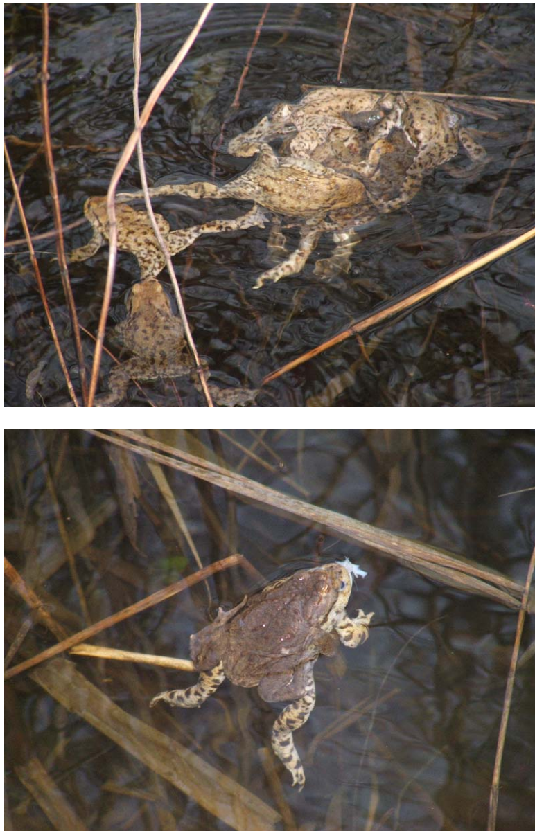
Figure no.3 Several males clasping a female (above) may result in injuries that lead to death of the female (below). This occurs frequently in Bufo bufo (Photo T. Hartel, Şercheş pond, Sighişoara)