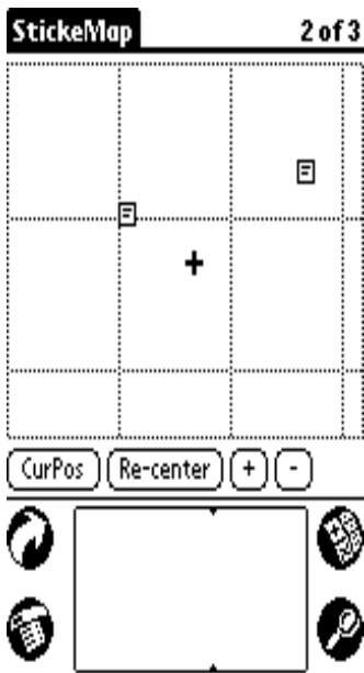
Figure 1: the user interface for an ecology application: the two small square icons represent points for which information is available; the cross shows where the user is