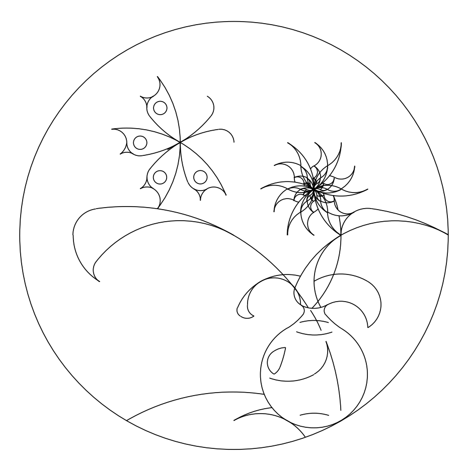
Figure 2: Image of a butterfly and a vase with a flower, reprinted from Leonardo [67, 81]. An explanation of how the image was constructed and why it has a very short description is given in Figure 3.