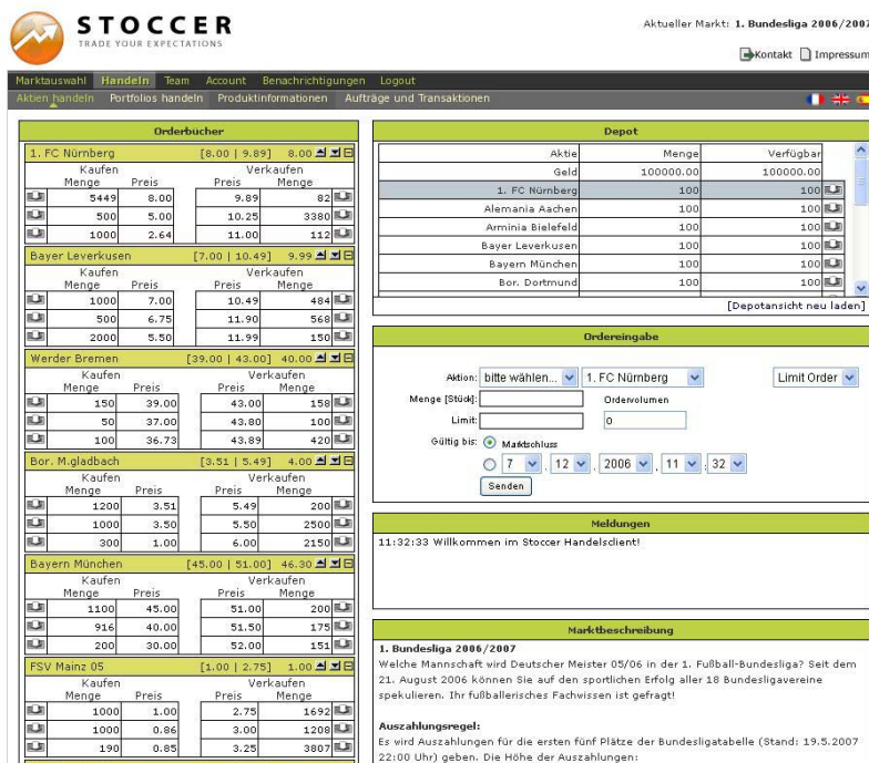
Figure 1: Web interface of the STOCER trading platform

average amount of 50 Euro (IS 2 ). Performance-compatible means that the payment linearly depended on the users' deposit value in the prediction market (deposit value divided by 10.000 currency units). In the third group, individuals were paid according to their ordinal rank (rank-order tournament, IS 3 ). The user ranked first was paid 500 Euro, the second 300 Euro and the third 200 Euro. All the other users in this group did not receive any payment at all. This also results in an average payment of 50 Euro per person.