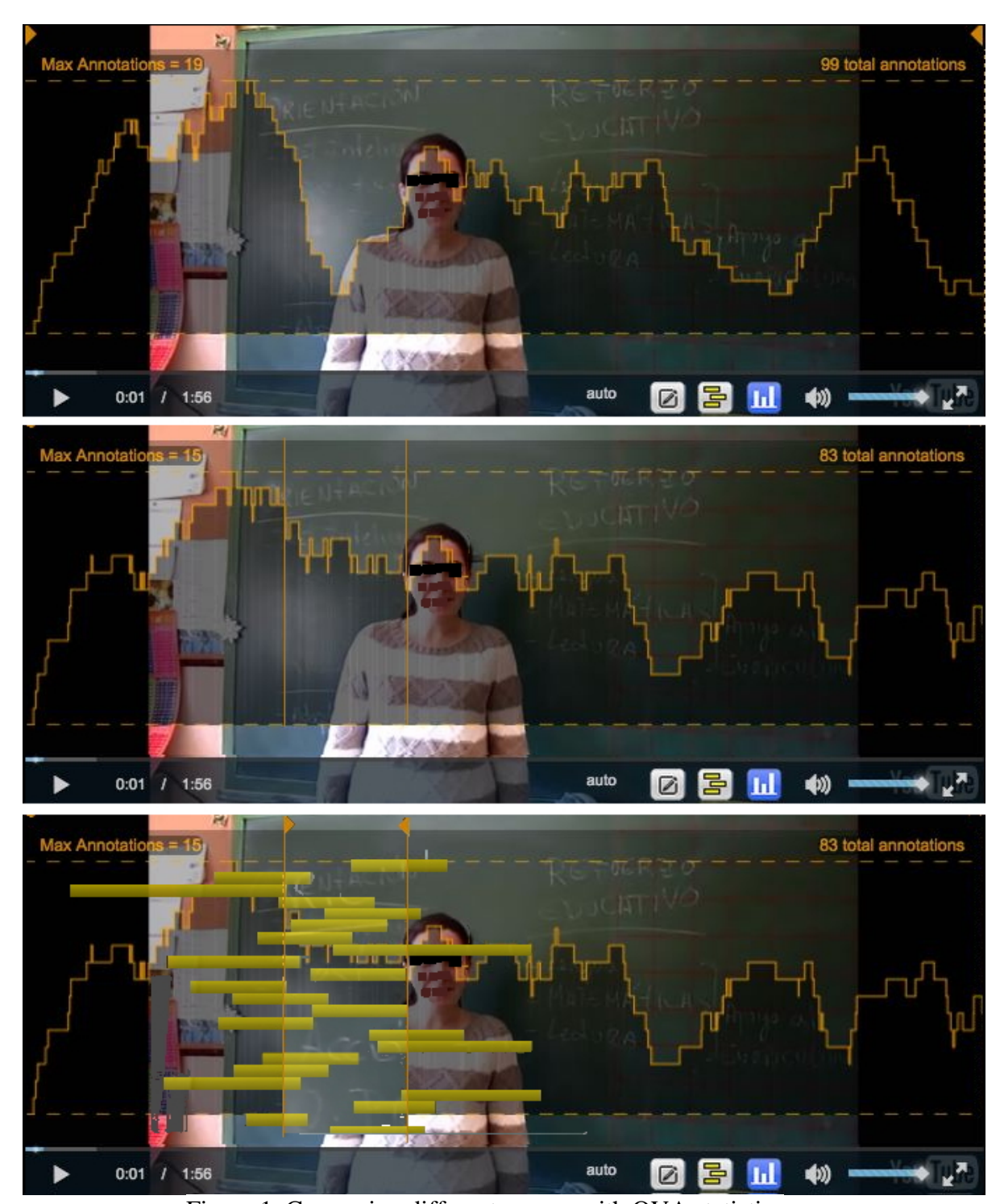
Figure 1. Comparing different groups with OVA statistics

As shown in Figure 1, a 4th year student of Practicum II Pedagogy presented her experience in a video, and the rest of students (from 2nd and 3rd year of Pedagogy) made their annotations in two groups: those who had previous experience in the Practicum and those who didn't-. The first image shows Group 2 annotations, and the other two images (middle