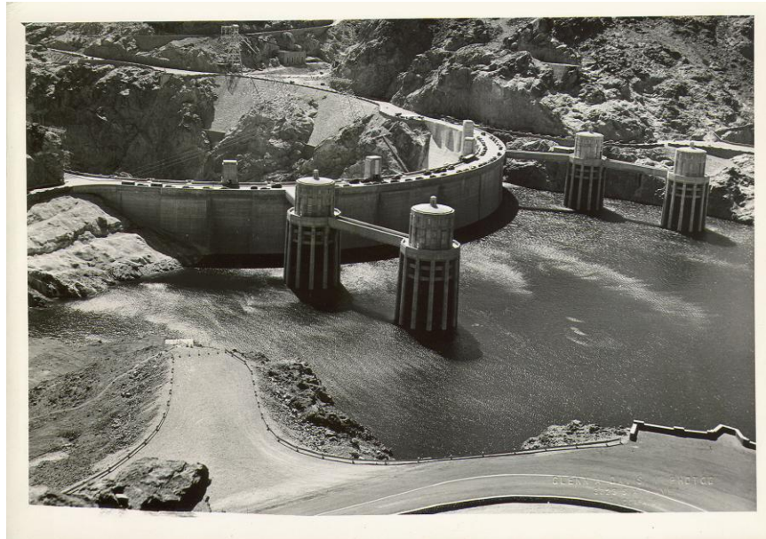
Hoover (not Boulder) Dam from the Arizona side (1937 or 1938?).