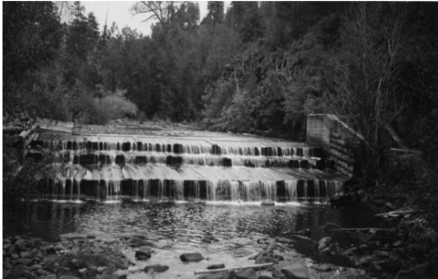
Mesa dam and ditch take-off on Middle Fork Weiser River, Idaho, located approximately 7 miles by road above U.S. 95. Mesa dam and ditch take-off (08-24-1941).