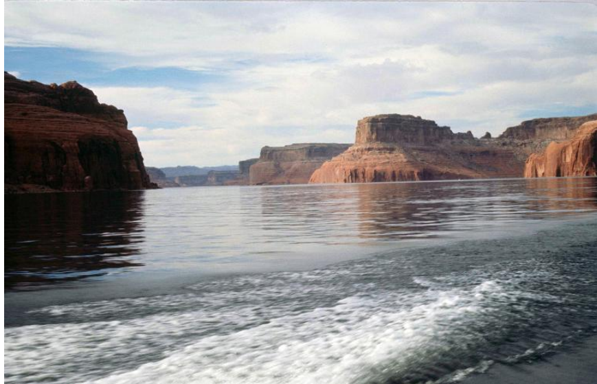
Lake Powell (1954-1972).

1. Climate Research Group: University of Utah studies climate and climate change with a focus on atmospheric dynamics include projects, presentations, and publications.