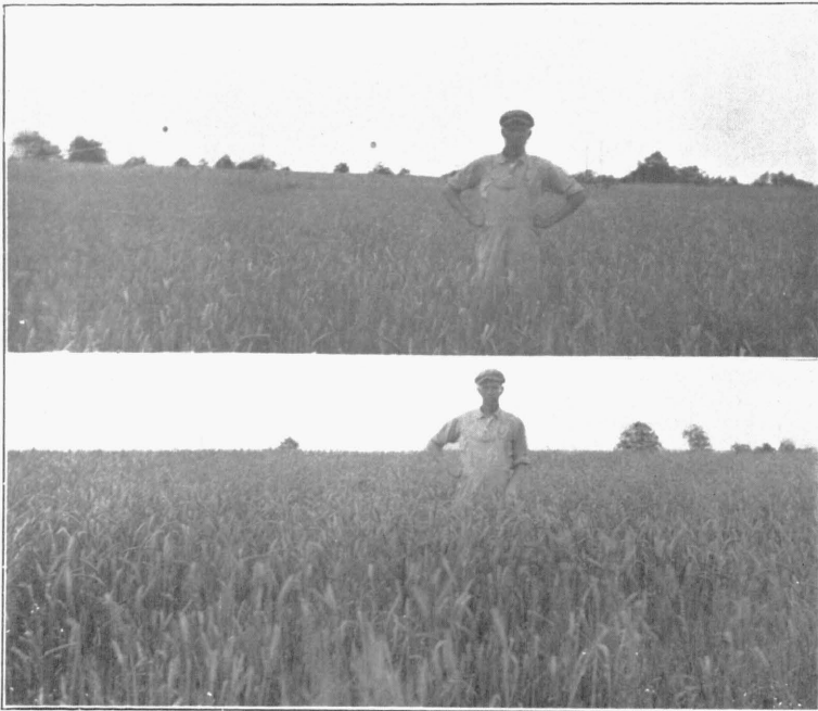
Figure 2. Wheat at Laclede 1914. Upper View on No Treatment Plot, Yield 16.3 Bushels per Acre. Lower View on Bonemeal Plot, Yield 35.4 Bushels per Acre.

No direct applications of fertilizers have been made on oats, it being thought best to depend upon residual effect of the corn fertilizers. When the oats crop is charged up with its share of the cost, however, the result is a net loss, except on the full treatment plot