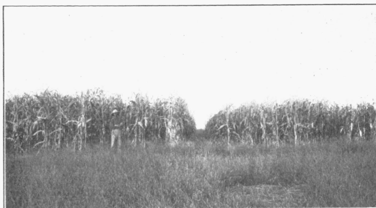
Figure 1.—Corn on Laclede Experiment Field 1909. Manure Plot (left) Yielded 39.5 Bushels and No Treatment Plot (right) Yielded 29.0 Bushels.

The results of the various soil treatments on each crop are shown in the following tables.