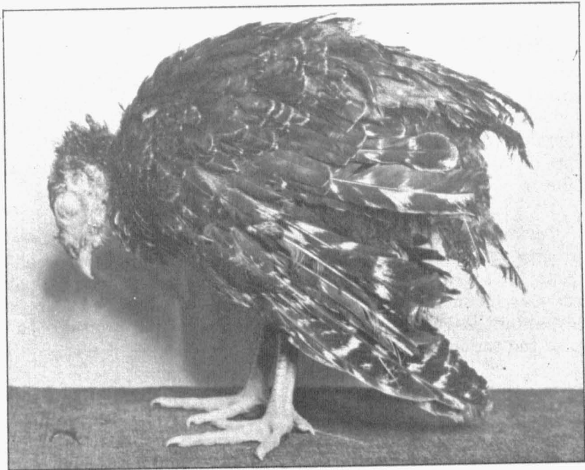
Fig. 2.—An advanced case of trichomoniasis in a nine-weeks old poult.

The outstanding symptoms of the disease in poults are loss of appetite, foamy brownish droppings, weakness, peculiar chirping sounds, and indications of being chilled. Very young birds are most