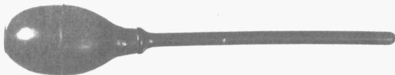
Fig. 4.—Two-ounce bulb syringe with an eight-inch hard rubber nozzle. It is used for administering the gentian violet solution, or the thin yeast food.

Individual treatment. Loss of appetite and refusal to eat ordinary mash is a serious problem in affected flocks and starvation often occurs. In practically all outbreaks the birds will eat with relish, the oats-yeast-cod liver oil diet when they will refuse ordinary mash. If the birds are too weak to eat they may be dosed (force fed) with a bulb syringe.