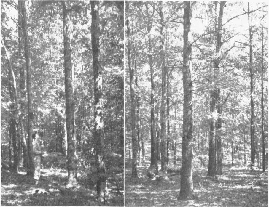
Fig. 2.—Scarlet and black oak stand in 1951. Left, pruned plot, codominant scarlet oaks in foreground. Right, unpruned plot, showing persistent dead branches on black oak.

than scarlet and black oak were not abundant enough in the stand to furnish conclusive data.