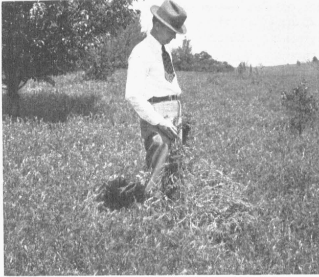
Fig. 2.—Hairy vetch is a good orchard cover crop for Missouri. Note the heavy and uniform growth on a rather poor soil.

A fairly good substitute for stable manure is so-called “green manure”. It consists of the growing of a leguminous “cover crop” or one composed of legume and non-legume plants. It has been estimated that about two-thirds of the nitrogen content of legumes is obtained from the air and about one-third from the soil. All is returned to the soil when the cover crop is plowed in. A legume, therefore, offers little competition to the tree for available nitrogen. It is of great benefit to the orchard when it is incorporated into the soil in sufficient bulk.