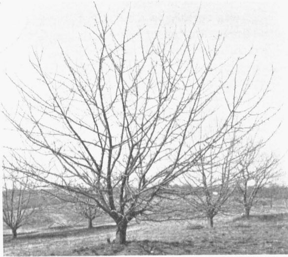
Fig. 5.—An apple tree maintained in good vigor and productivity by proper application of nitrogen.

for the nitrogen from it is released slowly. Because of this marked effect at flowering time, many fruit growers apply nitrogen solely with the object of increasing the fruit set. Under most circumstances nitrogen containing fertilizers will not only increase the crop but benefit all parts of the tree due to increased vigor and growth. Only vigorous trees can bear satisfactory crops regularly.