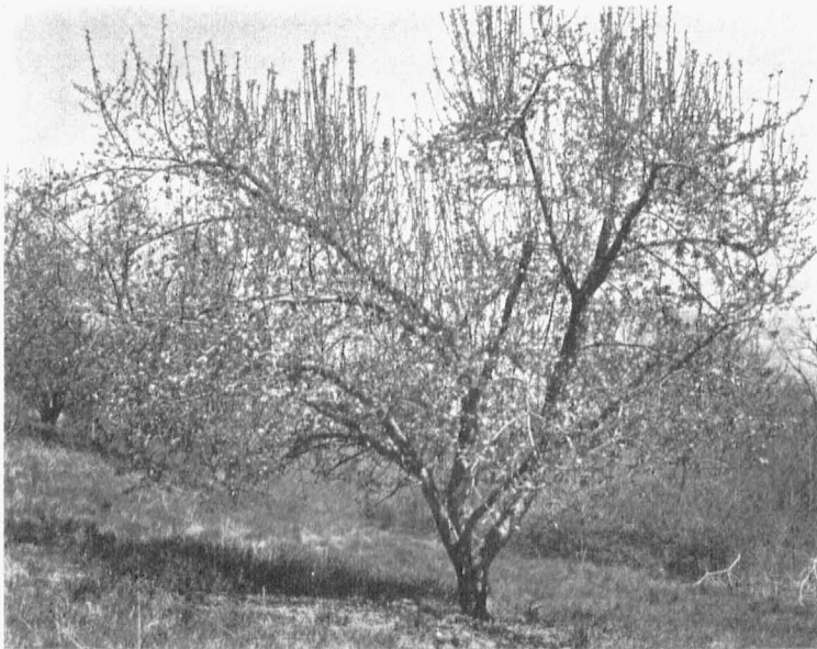
Fig. 6.—The result of heavy pruning and overstimulation with nitrogen.

Fertilization in Relation to Other Orchard Practices. —Neither soil fertilization nor any other orchard operation can be taken by itself but only in relation to other orchard practices.