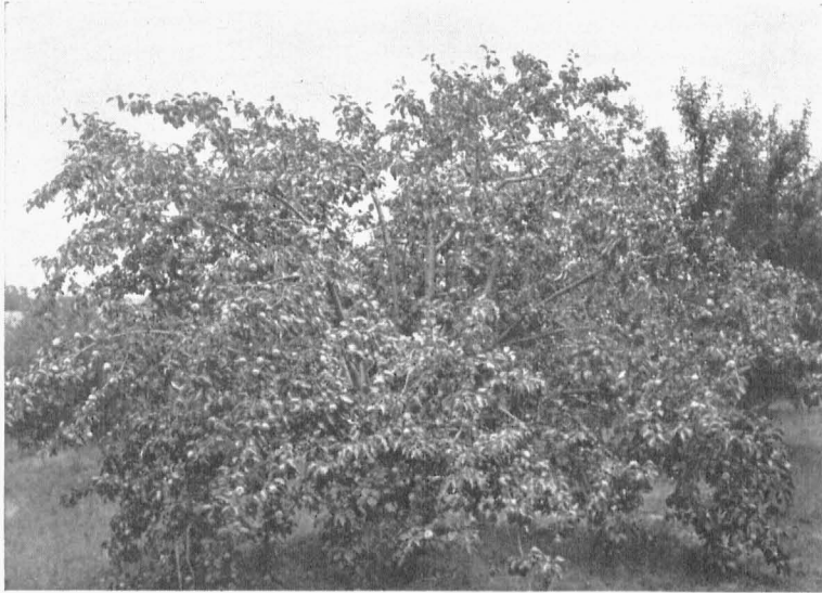
Fig. 3.—An extremely heavy set of fruit on an apple tree fertilized with nitrogen in the spring of the bearing year.

to be greater economy and more convenience in applying fertilizers in the fall than in the spring. Work is less pressing at this time and the ground is usually in a better condition to get about. Moreover, there is greater certainty that nitrogen will be available to the trees early in the spring when it is needed most.