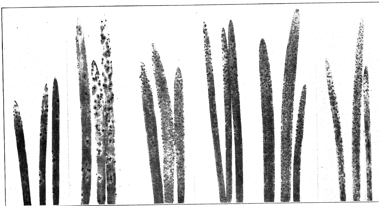
Avena sativa L. var. Sixty-Day (166)