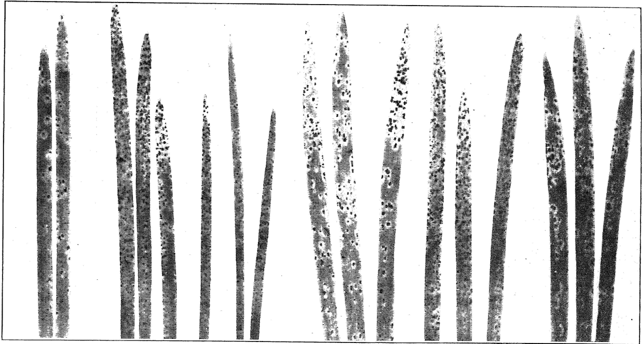
Avena fatua L. (143) Avena nuda L. var. Avena strigosa Schreb. (26) (29) Avena sterilis L. var. Burt (175) Avena sterilis L. var. Burt (254) Avena sterilis L. var. Fulghum (257)