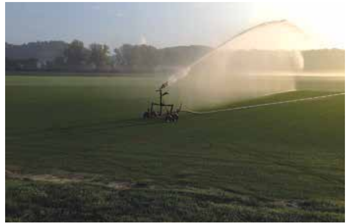
Figure 5. Hose-pull traveler irrigation system.