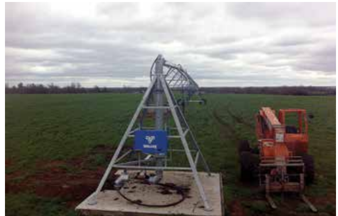
Figure 6. Center-pivot irrigation system.

A major advantage of the traveling gun system is its flexibility. It can accommodate fields of many sizes and shapes. Additionally, it can put on more water and cover larger acreages than low-pressure traveling irrigator or pod-line systems.