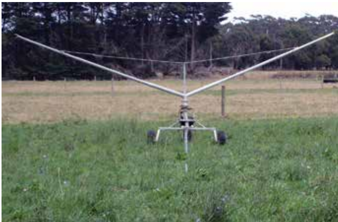
Figure 4. Low-pressure traveling irrigator.