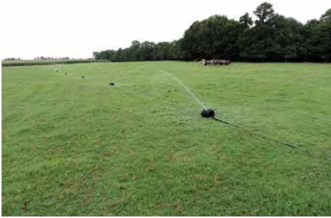
Figure 3. Pod-line irrigation system.