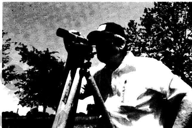
Consulting engineers provide technical services in designing livestock waste management systems.

Design criteria for animal waste management systems is found in DNR Manual 121, “Design