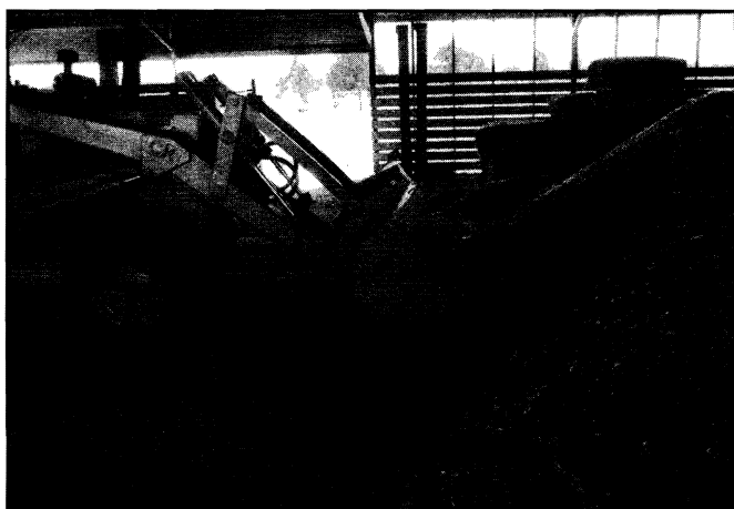
A litter-storage structure can increase flexibility and convenience in managing poultry litter.

The following example illustrates the use of data in Table 1 to estimate litter storage requirements.