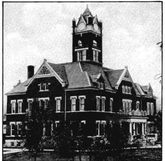
Fig. 2. Perry County Courthouse, 1904- Architect: J. W. Gaddis