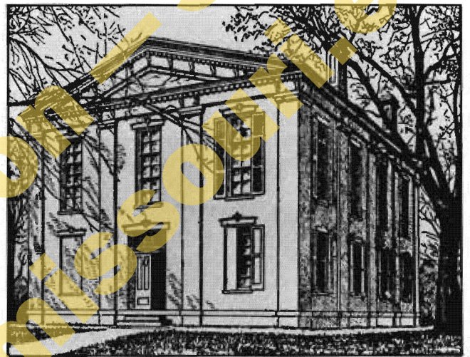
Fig. 1. Perry County Courthouse, 1859-1900s.

Caldwell and Drake, Columbus, Indiana, contracted for construction in January 1904. Construction began in February 1904; cornerstone ceremonies were conducted June 4, 1904. Total cost on the red brick, 65-by-92-foot building was $31,819. The courthouse continues in use today (Fig. 2.)