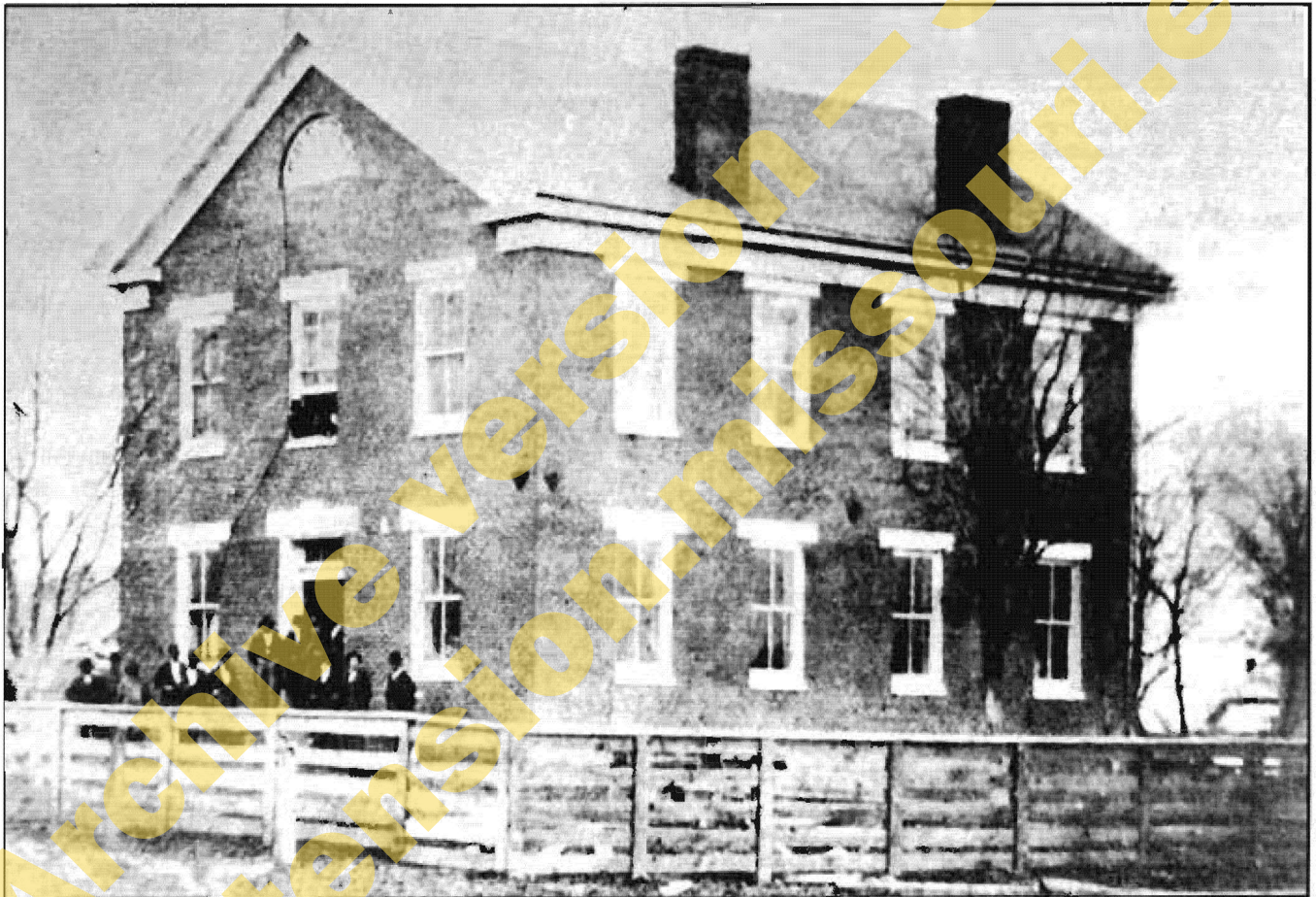
Fig. 1. Morgan County Courthouse, 1844-1887. (From: Versailles, Missouri—Its First 125 Years )