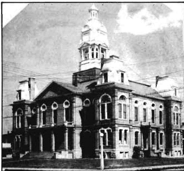
Fig. 2. Morgan County Courthouse, 1889-. Architect: William F. Schrage