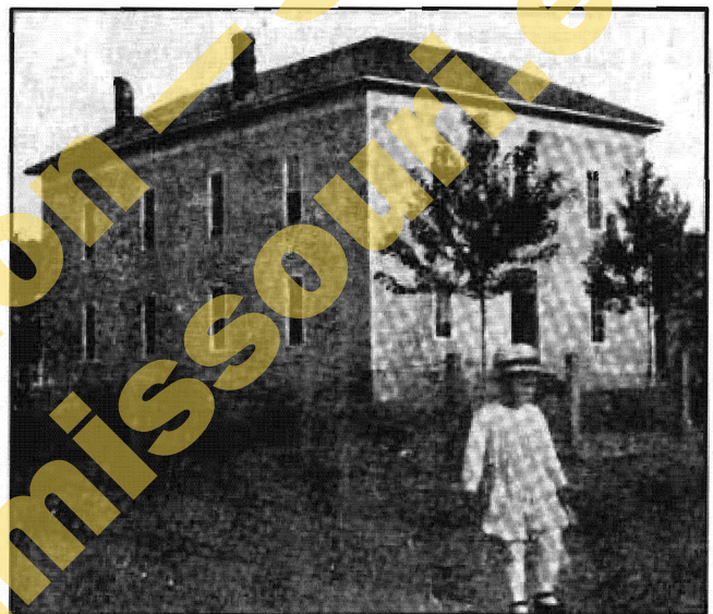
Fig. 1. Douglas County Courthouse, 1888-1937.

Retaliation came when citizens of Militia Springs (called Ava since 1881) built a $350 courthouse in 1872, retrieved the records and placed them in a log vault. Vandals burned the Militia Springs courthouse, destroying many records in July 1872, according to the Jefferson City People's Tribune . The paper's account carried a taste of cynicism: