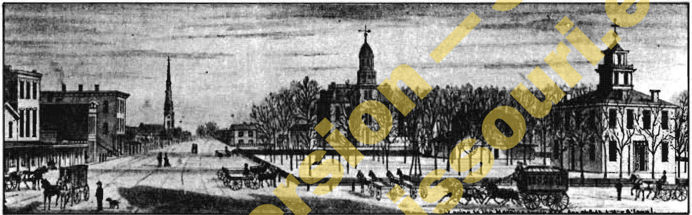
Fig. 1. Knox County Courthouse (right), 1848-1885. (From: Illustrated Historical Atlas of Knox County, Missouri , 1876)