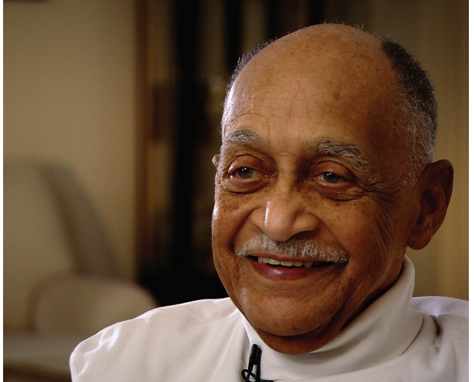
Eliot Battle, educator and civil rights pioneer