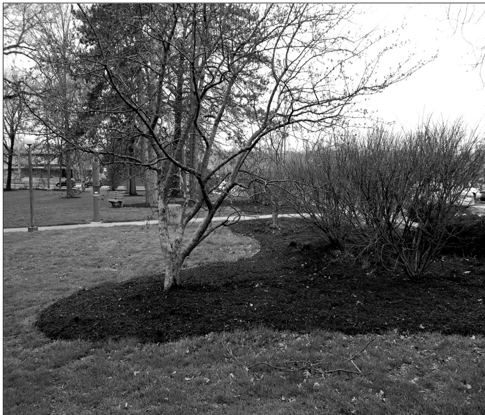
Figure 2. Idea for landscape plantings. Consider planting groups of trees and shrubs in large, mulched planting beds. Such groupings can be attractive and simulate natural conditions.

Many large balled and burlapped trees are sold with wire baskets securing their root balls. There is debate about whether the wire should be removed at planting. Based on the limited research available, most tree-care professionals recommend removing the top ring of wire. Because most of the roots of a tree are found within a foot of the